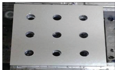
Figure 2: AISI D2 after drilling process