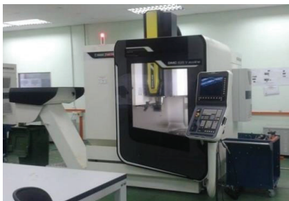
Figure 1: DMG 365 V Ecoline CNC machine

The experiments were carried out on 3 axis CNC milling machine in dry condition as shown in Figure 1. AISI D2 tool steel was selected as workpiece which was prepared at 100 mm width × 100 mm length × 10mm thickness size. The programming for drilling process has been done using Catia V5 software. Figure 2 shows the specimen of AISI D2 steel after drilling process. Details experimental procedure can be referred to Osman [11] and Ammar [12].