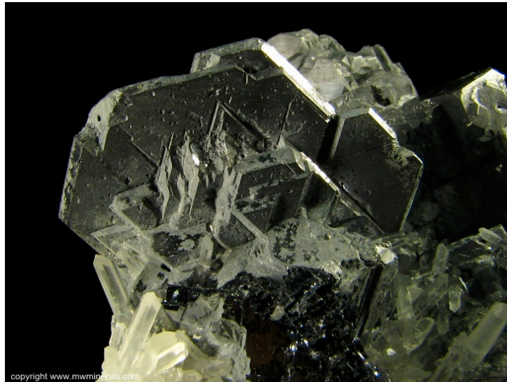
Figure 12. Photograph showing the platy character of spinel-twinned galena from Maden, southern Bulgaria. Photo by Walter R. Kellogg on M&W Minerals website (37).

The Madan Ore Field in southern Bulgaria comprises a district of 39–40 mines that have worked large Pb-Zn-Ag deposits and produced 95 MT ore over the last 50 years. The ores are Mn-skarn deposits that were deposited at 350–280 °C, and with ore grades of 2.54% lead and 2.10% zinc. The platy character of spinel-twinned galena from Maden is shown in Figure 12. The picture is by Walter R. Kellogg and posted on the M & W website [37].