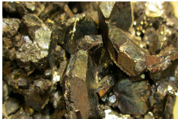
Figure 6. Photograph showing six or seven 1 cm platy galena crystals indicating that they not only consist of two twin portions but also show that the twins are penetration twins.