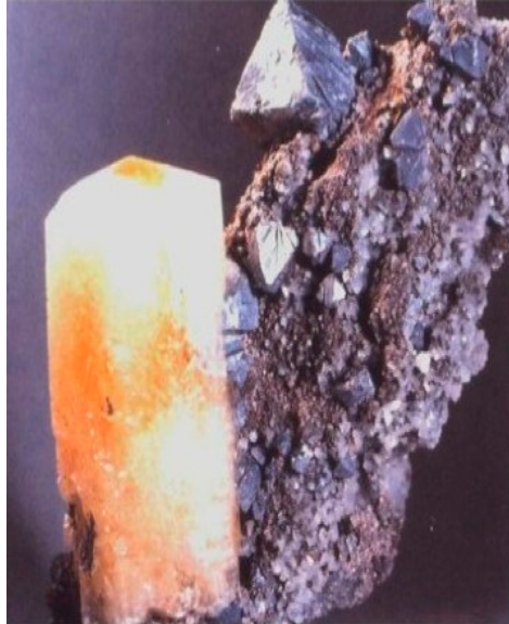
Figure 2. Octahedral galena deposited in open space and partly covered by later calcite. The largest octahedron is about 2 cm across and has a small cubic modification.

steel galena ores clearly have formed by rapid crystallization from oversaturated ore fluids. All of these occurrences of dendritic galena appear to be unusual variations of cubic galena where it formed by rapid crystallization from oversaturated ore fluids.