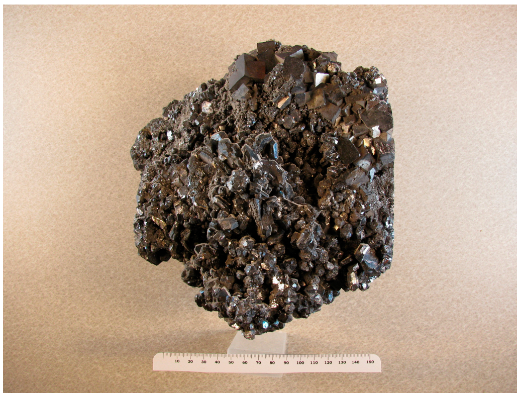
Figure 4. Unusual galena specimen from the Magmont mine that contains 60 platy galena crystals. The specimen is about 13 cm across and weighs 20 pounds. Specimen collected by Pete Sweeney.

The present study of Viburnum platy galena began a few years ago when the writer acquired a single large lead ore specimen from the Magmont mine in the Viburnum Trend that contained an astonishing number of platy galena crystals. The specimen was collected by the late Pete Sweeney when he was chief geologist at the Magmont mine. The specimen is 13 cm across, weighs about 20 pounds, and exhibits 60 plates of galena partly intergrown with quartz and cubic galena (Figure 4).