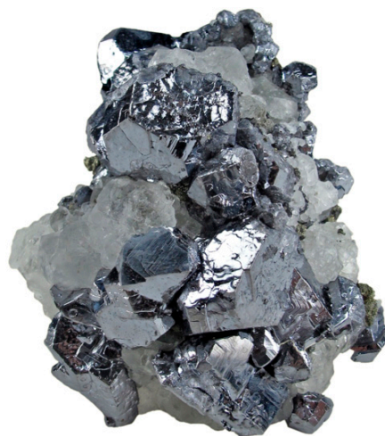
Figure 13. Photograph showing the platy character of spinel-twinned galena from Naica, northwest Mexico. Photo courtesy of Dr. Robert Lavinsky, The Arkenstone [38].

The Naica lead mine in northwestern Mexico, located in State of Chihuahua, is the largest lead mine in Mexico. The deposit is a lead-zinc skarn deposit that contains 4.9% lead, 1.1% zinc, and 1.7% copper. Figure 13 shows the platy character of Naica spinel-twinned galena. The picture in Figure 13 is courtesy of Dr. Robert Lavinsky [38].