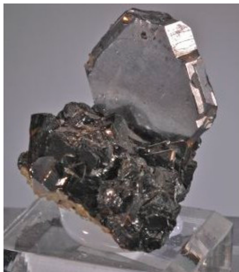
Figure 11. Photograph of spinel-twinned galena from Dalnegorsk, southeast Russia. The photograph illustrates the flat characteristic of spinel twins.

The Dalnegorsk Pb-Zn mine in Russia is a large skarn deposit in extreme southeastern Russia near the border with China. Figure 11 shows the flat character of the spinel-twinned galena from Dalnegorsk. The photograph in Figure 11 is from http://www.minfind.com and posted on the minfind website [36].