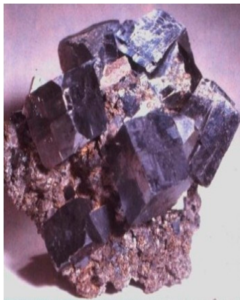
Figure 3. Cubic galena deposited in open space. The cubes are about 2 cm across and some have small octahedral modifications at their corners.