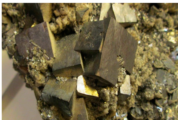
Figure 9. Photograph showing that cubic galena was deposited after and encloses both spinel-twinned galena and quartz. This shows that the spinel-twinned galena was deposited in the paragenetic position of octahedral galena. The galena cubes are about 2 cm across.