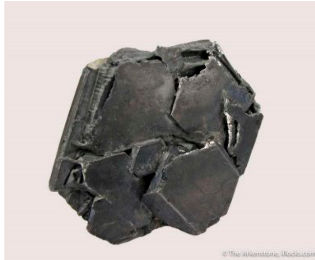
Figure 10. Strongly flattened spinel-twinned galena “Gonderbach twin” from Gonderbach mine, Germany [35].

Gonderbach mine have been illustrated in the literature, textbooks, and on the internet. Figure 10 exhibits an especially flat spinel-twinned galena from the Gonderbach mine [35]. A detailed discussion of the character and formation of spinel-twinned galena at the Gonderbach mine was given by Kolbe [33].