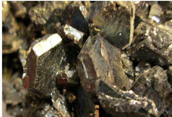
Figure 5. Photograph showing six or seven platy galena crystals. The crystals are about one centimeter in size and they show that the plates consist of two portions suggesting that they are twinned crystals.