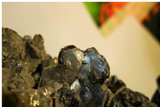
Figure 7. Photograph showing Viburnum Trend 1 cm platy galena (center of photograph) with an indentation that is characteristic of spinel-twinned crystals.