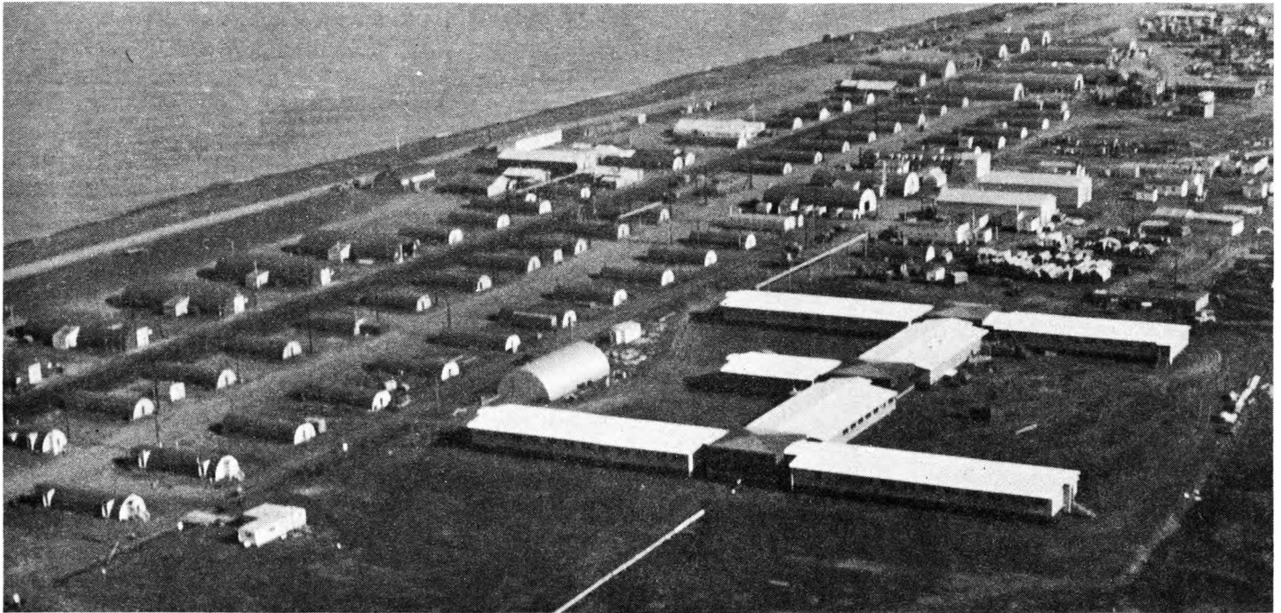
Figure 1. Naval Arctic Research Laboratory, summer 1969.

is a small natural gas field with 5 producing wells; and 1 mile to the east of the camp is the DEW Line Station designated as POW-Main.