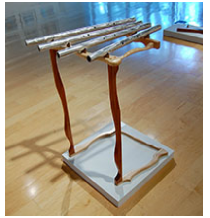
Luke Criddle, BFA Senior Exhibition 2016

LC: Find out what your favorite things happen to be and make a career out of that! I can't imagine doing something that I didn't love day in and day out; it just wouldn't be worth it. I really don't wish that for anyone.