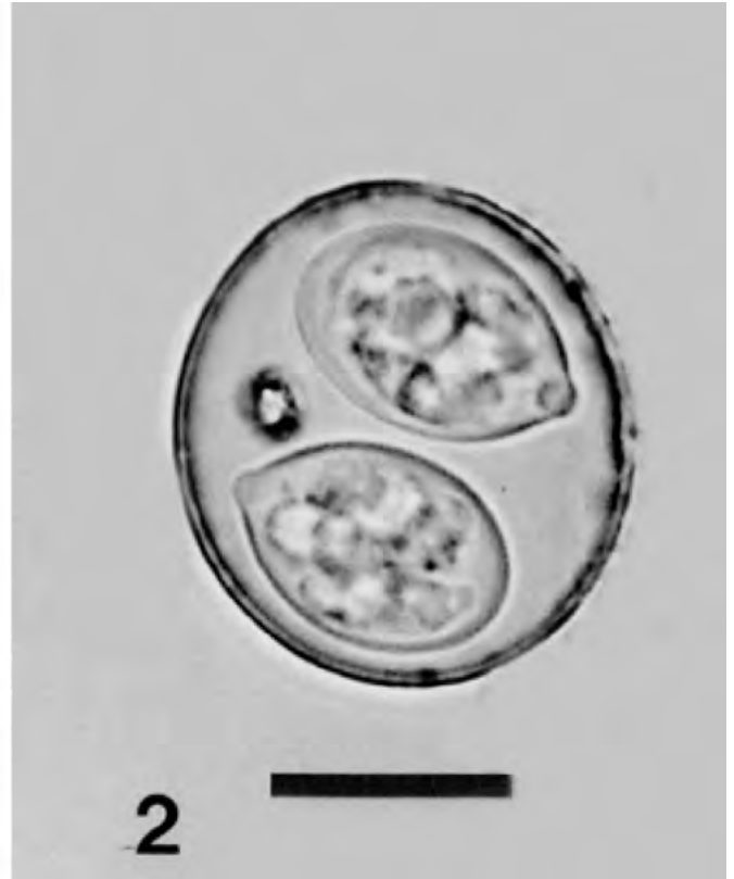
Fig. 2. Bright field photomicrograph of sporulated oocyst of Isospora dendrocinclae n. sp. from the white-chinned woodcreeper, Dendrocincla merula . Scale bar: 10 \mu m.

quences for the isolates are deposited in GenBank. The Guyana isolate accession number is GU952797 and the Peru isolate accession number is GU952798.