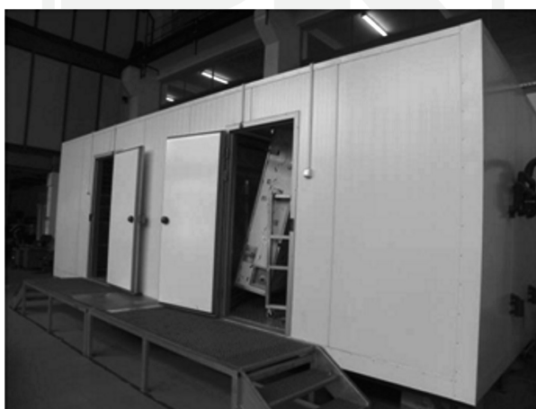
Fig. 3. General view of calorimetric hot box (CHB) system