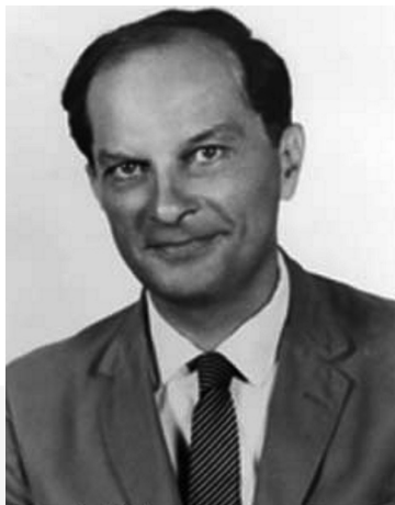
Fig. 1. Stanislaw Ulam (1909–1984)

Lvov period of the life of outstanding Polish mathematician Stanislaw Ulam lasted from his birth (1909) until 1939, when he moved to the United States. The aim of this note is to provide a review of Ulam's mathematical results obtained in Lvov.