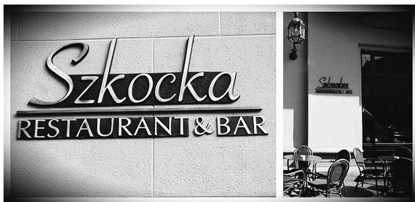
Fig. 3. Modern picture of the Scottish café; it is again named “Szkocka”

He was one of the most active members of the Lvov School of mathematics. Ulam participated in sessions of Lvov mathematicians in the Scottish café (Kawiarnia Szkocka, in Polish) and contributed to the Scottish book, a list of open problems formulated by these mathematicians.