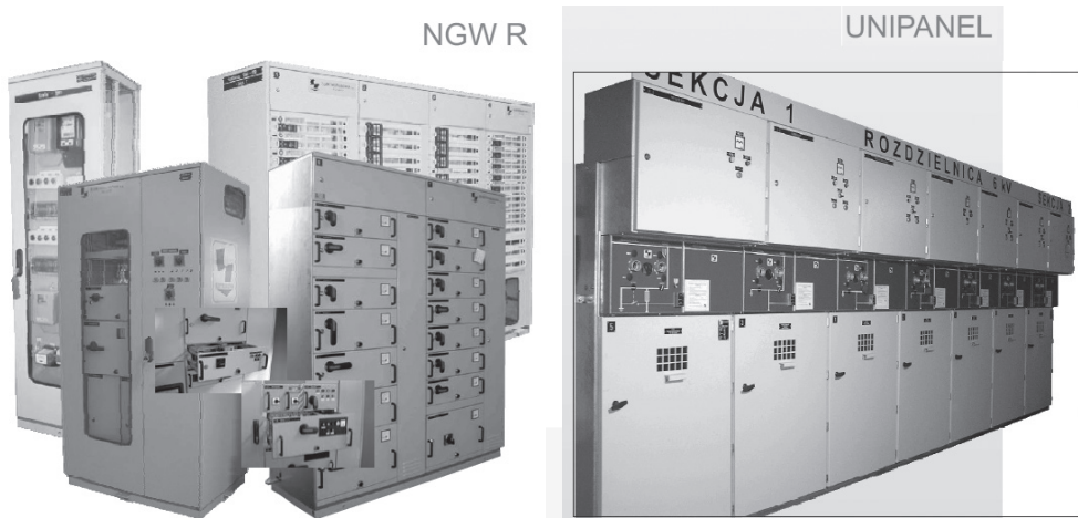
Fig. 2. Low and medium voltage switchgears produced by the ELEKTROBUDOWA S.A. company