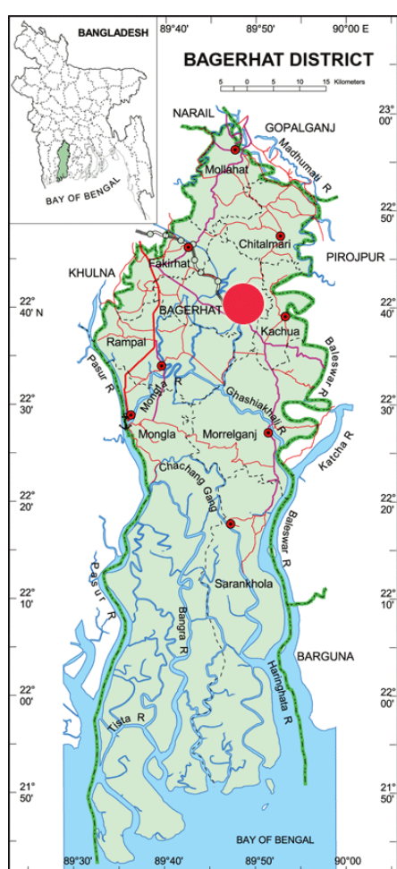
Figure 1: Map of Bagerhat district, Bangladesh, indicating the case study area by red circle

Study area and duration: The coastal area lies in the alluvial plains of Bangladesh between 89.00° E and 92.20° E in the northern and north-eastern part of the Bay of Bengal (Brown 1997). The study area, Bagerhat district is lies between 89°30" and 90°00" E. The case study was carried out in Bagerhat Sadar, a sub-district of Bagerhat district, a well-known shrimp and prawn production zone in the south-western part of Bangladesh (Figure 1). The total area of this district is 3959.11 km 2 and Bagerhat Sadar retains 272.73 km 2 and thus the study area covered 6.89% area of Bagerhat district and the duration of the study was March, 2012 to January, 2013.