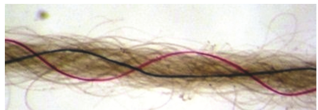
Fig. 1 — Tracer fibres in spun yarn