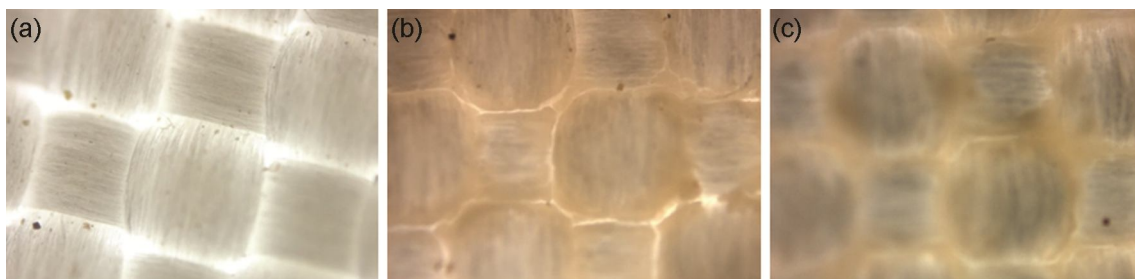
Fig. 3 — Microscopic images of samples after drop test [(a) non-treated Dyneema, (b) 34% STF treated Dyneema, and (c) 38% STF treated Dyneema]

mg.cm and the values for 34%, and 38% kaolin samples are 3611.02 mg.cm and 4502.05 mg.cm respectively. Conventional chest pad material with the similar dimensions does not indicate an adequate flexibility to provide an accurate reading from the instrument, indicating a higher stiffness value. Hence, the Dyneema samples impregnated with the STF combinations as mentioned above provides better flexibility than the traditional chest pad material.