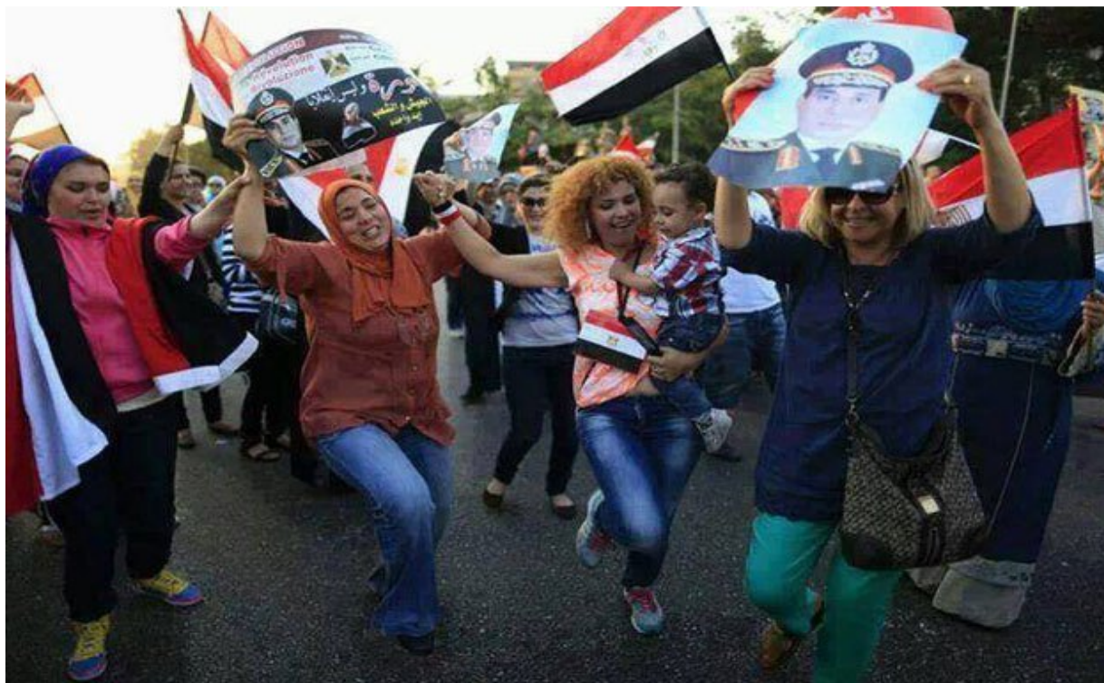
Figure 5. Supporters of Field Marshall al-Sisi carry his photos in an attempt to persuade him to run for the presidency. January 14, 2014. 174

In the following picture, we can see liberal women were singing and dancing in favor of the head of the military coup, general al-Sisi, who toppled the democratic elected president.