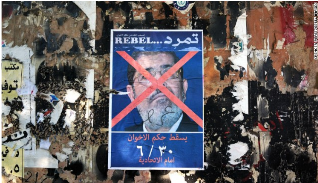
Figure 4. An anti-Morsi poster is displayed on a wall in Tahrir Square on July 3, 2013. 168

that they collected more than 15 million signatures for a petition that calls for President Morsi to step down to allow for fresh presidential elections. 167