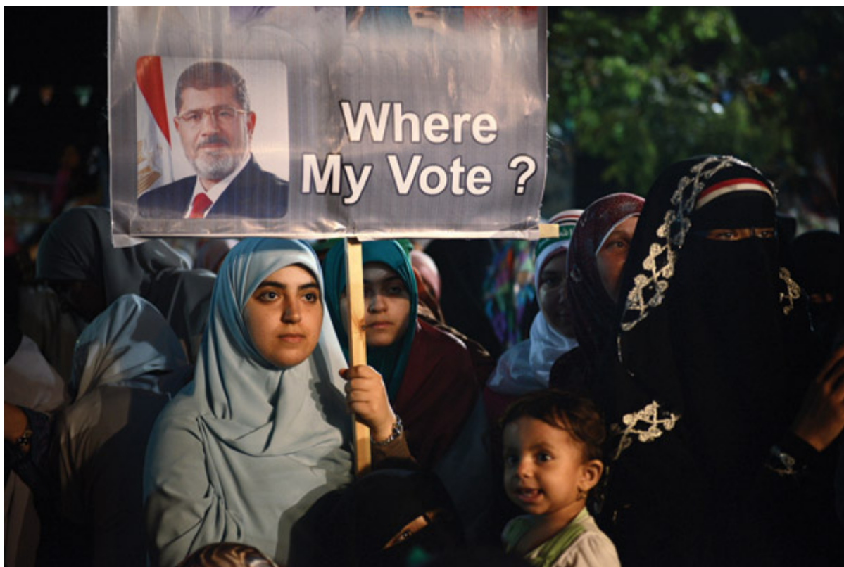
Figure 6. Supporters of Egypt's deposed President Mohamed Morsi outside Rabaa al Adawiya mosque in Cairo, on the eve of Eid al Fitr, August 7, 2013. 175

The following pictures show us examples of how Islamist women supported democracy and condemned the military coup, and what happened to them when they denied the military takeover.