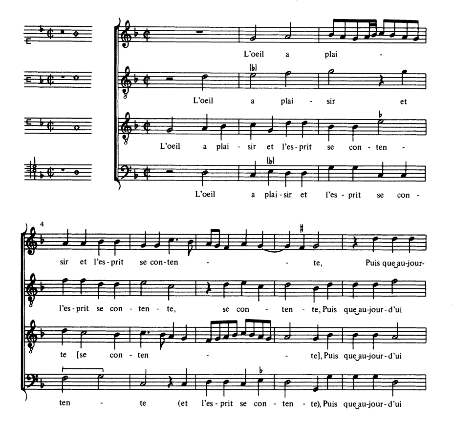
EXAMPLE 3. M. Lasson, L'oeil a plaisir, Attaingnant 1534<sup>14</sup>, No. 6.

first adopts a manner of composition somewhat removed from the terse economy of means just encountered. Yet, close examination of the superius part in particular will reveal that the chanson actually adheres rather closely to the structural plan of Claudin's approach: the opening and closing lines are stable, two-part units, while the medial phrases provide increased rhythmic activity, more frequent changes in register, and open cadences that contrast with the relative closure of what precedes and follows.