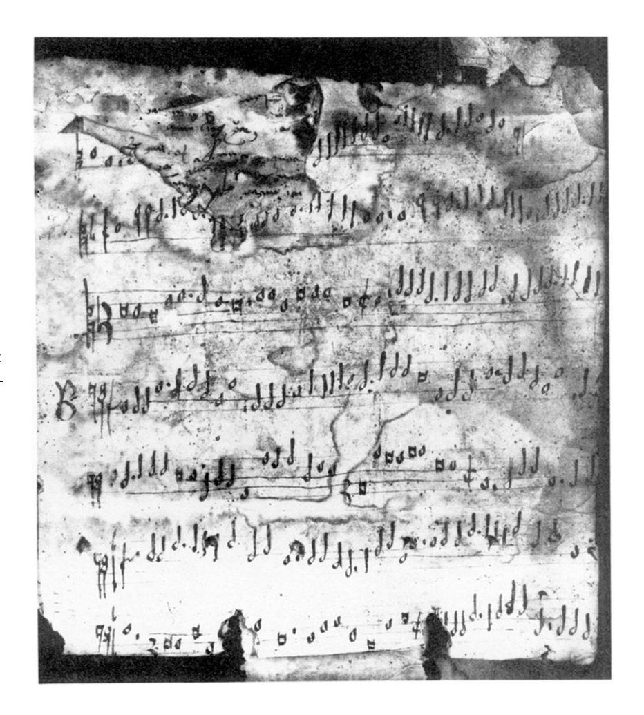
PLATE 1. Nancy G 626A