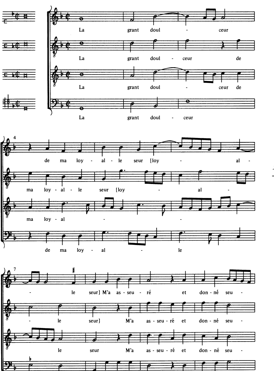
EXAMPLE 1. M. Lasson, La grant doulceur, Attaingnant 1534<sup>14</sup>, No. 5.