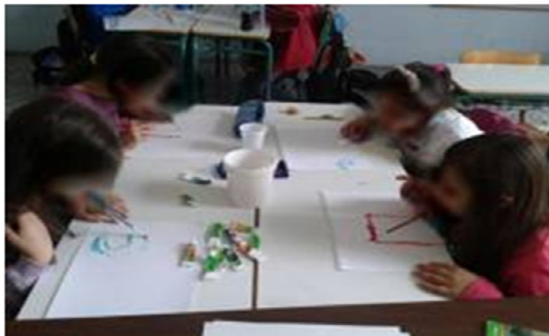
Picture 6. Mouth drawing with temperas.