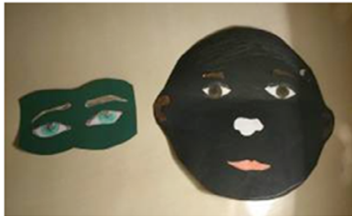
Picture 1. Racial characteristics made by paper.