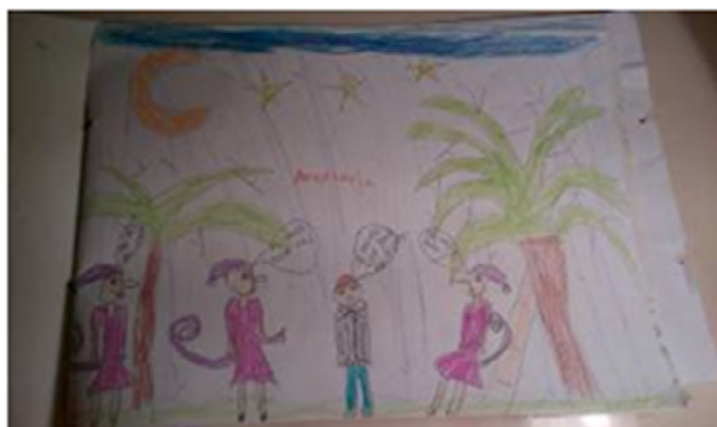
Picture 2. Sample of a drawing in a mini story book.