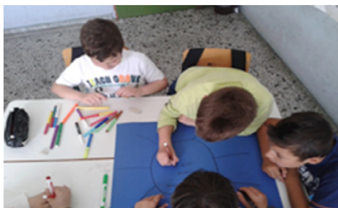
Picture 3. Working in a group to create a poster.