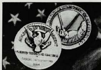
National Medal of Technology Recipient

We invite you to learn more about these opportunities and the excellent career environment we provide. Please contact us to discuss your background and interests and to arrange a local interview.