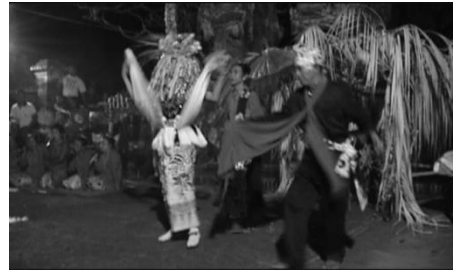
Figure 3. Seblang dance ritual by the Osing people of the village of Olehsari, Banyuwangi region, East Java for 4th Pasamuan Seni & Ketuhanan/ Sharing Art & Religiosity at the Mandala Wisata Samuan Tiga in Bedulu, Bali, 26 March 2004.

realm for prosperity, healing illness, and well-being.