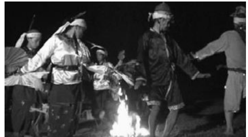
Figure 4. Balia customary ceremony by the Kaili people from the Donggala district of Central Sulawesi for 4th Pasamuan Seni & Ketuhanan/ Sharing Art & Religiosity at the Mandala Wisata Samuan Tiga in Bedulu, Bali, 26 March 2004.

What emerged from sharing art and religiosity inspired by Samuan Tiga was a participatory space generated from traditional and modern art offerings by people of diverse cultures and faiths and a common field for intercultural and interreligious creativity. In 2004, this