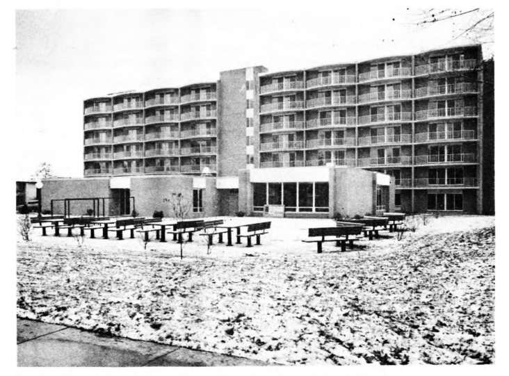
Fig. 2. High-Rise for the Elderly and Handicapped, Ann Arbor, Michigan

which was recently completed. The project that we are considering is a 105 unit High-Rise Structure for the Elderly and Handicapped. The 105 units consist of 102 apartments with one bedroom each and three apartments with two bedrooms. The total project cost was $1,600,000. A photograph of the project as completed during the month of December 1971 is shown in Figure 2.