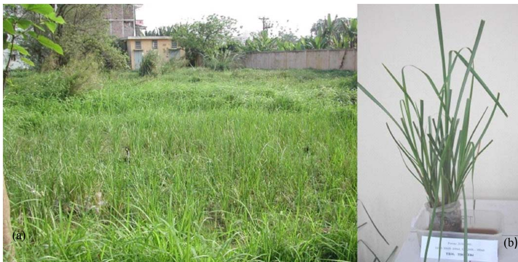
Figure 1. (a) Vetiver grown land and (b) it was grown in laboratory chamber by contaminated water for 36 days

three parts of shoots (S1 - 10 cm of the shoot is from the meristematic region, S2- next 10 cm of the shoot, S3- remain part (about 20-40cm) in the top of the shoot). All samples were sieved through a 2-mm mesh and well mixed (Figure 2).