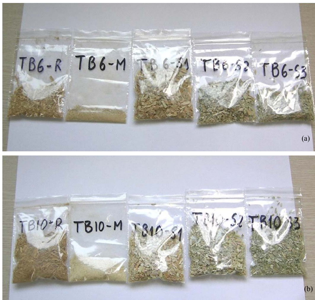
Figure 2. (a) Vetiver samples TB6 and (b) TB10 were sieved through a 2 mm mesh and mixed well