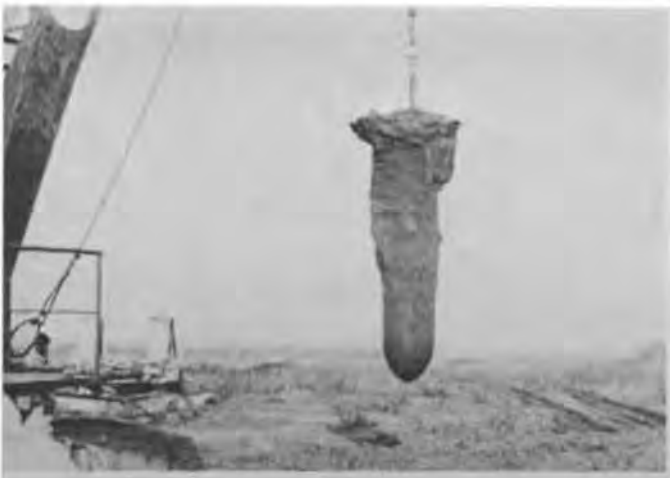
Fig. 3 - The sample is pulled out by the Crane