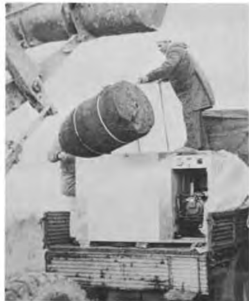
Fig. 5 - The sample is stored