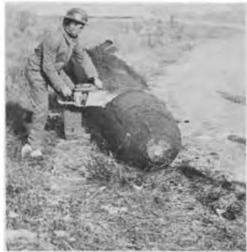
Fig. 4 - The sample is sawed