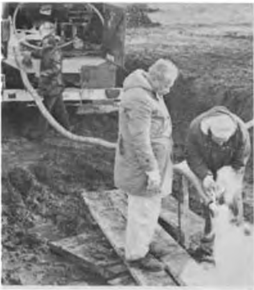
Fig. 2 - The test area

of 2.5 m from the ground surface a sand layer 5m thick. The relative density of the sand, estimated by the SPT blow-counts and the Gibbs and Holtz (1975) correlations was about 60%. The ground water level was 1m below the ground surface. A thin SPT tube of 76 mm diameter was inserted in a hole predrilled without circulating water and its lower end was sealed. A 17 mm diameter freezing tube was inserted inside and liquid nitrogen circulated. After 12 hours a sample 3.10 m length and 55 cm diameter was pulled out. Figs. 2, 3, 4, 5 show the test area, the sample pulled