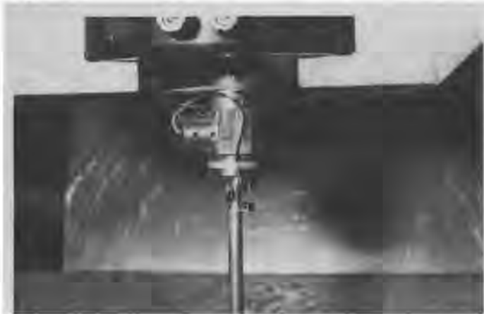
Fig. 1 Experimental Setup

15.3 mm. At the top of the tubing is press-fit an aluminum disk to which a truncated conical shaped cap is attached. This shape was used to accommodate the piezoelectric load washer. The load cell was clamped between this cone and a cable clamping block above. The clamping block serves to isolate and minimize any possible vibration of the high insulation resistance cable connecting the load cell with the load cell charge amplifier. Attached to the top of the cable clamping block is an accelerom-eter housing. All the above components were fabricated from aluminum. This entire pile assembly is attached to the exciter armature by a quick setting epoxy. Figure 1 depicts this entire assembly after post-test with-drawal. The model pile test described here was conducted in a centrifuge environment of 60 g.