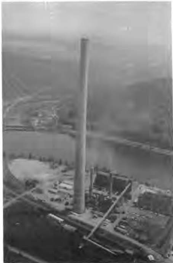
Figure 1. General View of a 304.8m Chimney.

The entire rock-column encountered in this investigation comprises sandstones of variable composition. It exhibits fine-grained to coarse-grained with depth. Good correlation of the sandstone types was obtained by visual examination, and confirmed by density tests. For convenience of description, the rock-units have been noted as A, B, C and D in Figure 2.