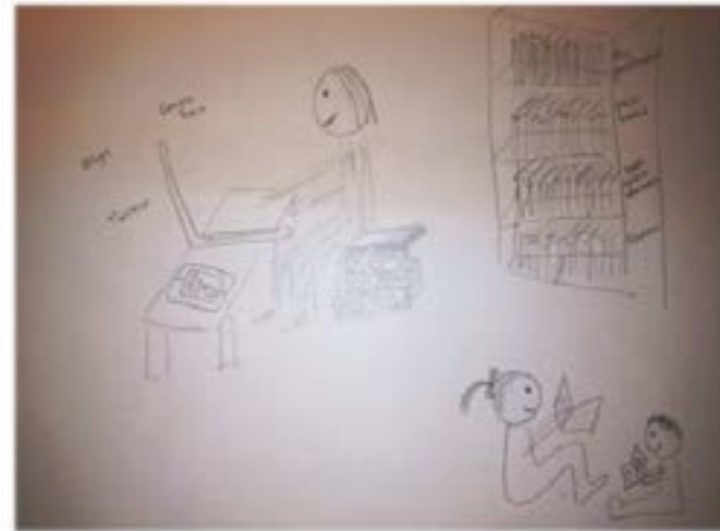
Figure 1. Julie's visual representation

and extended into the realm of social media. In the corner of Julie's illustration were two children with books reading together, representing her own children and again showcasing the value she put on social literacy experiences.