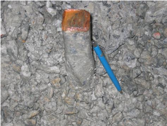
Fig. 3. Twisted Helical Anchor.

Longitudinal cracks (i.e., cracks in the long direction of the pool) were observed in the pool floor prior to its demolition. Diagonal cracks radiated out from the corners of the pool slab which intersected the cracks running longitudinally. Both types of cracks were a result of the upward forces on the pool floor as a consequence of the slab hold-down failure.