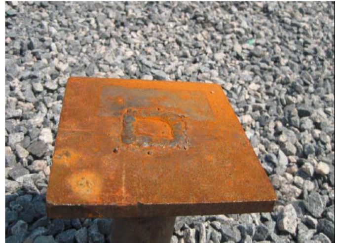
Fig. 4. Field Modified Anchor Cap Where Helical Shaft Has Been Inserted Through a Hole in the Cap Plate and Welded.

length varied between 22 to 32 feet. All of the installed anchors met the driving criteria defined as 5,500 ft-lb of torque, or the manufacturer defined maximum twist of the steel rod. A verification load test was performed on five anchors. One of the tested anchors failed the 200% working load test acceptance criteria.