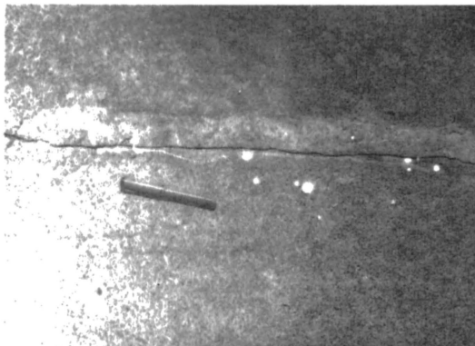
Fig.4 - Major Joint Rock Fracture along N70^{\circ}E-S70^{\circ}W direction

is feebly foliated. The granites are transversed by few basic dykes and pegmatite veins. Figure 3 shows the location of granite quarries in the area. The general trend of major joint set in the granites is along N 70^{\circ}E - S 70^{\circ}W and dips 55^{\circ} towards north west. Two sets of minor joints trend along N20^{\circ}E - S20^{\circ}W with vertical dip and along N-S with 75^{\circ} dip towards west. The rock fracture associated with rockburst follow the trend of major joint set along N70^{\circ}E-S70^{\circ}W (Fig 4). The set of joints exposed during excavations in the quarries were noted to extend upto one or two metres, and mostly fresh sheet granites in exposed in the quarries.