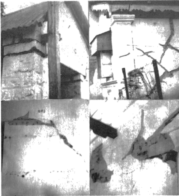
Fig.1 - Cracks in buildings during the rockburst

consisted of fall of plaster, cracks in masonry walls and arches, and collapse of portions of random rubble stone masonry walls. During the November 27, 1971 rockburst damage to buildings was of similar nature (Fig.1), but it extended over a large area of the Estate of Bharat Gold Mines Private Limited (BGML) and Factory and Township of Bharat Earth Movers Limited (BEML).