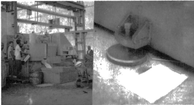
Fig.2- Link Boring Machine, 20 tons in weight, which was moved 1 cm towards south. Shaded area shown in the photograph on the right was exposed after resetting of the steel pad

consisted of fall of plaster, cracks in masonry walls and arches, and collapse of portions of random rubble stone masonry walls. During the November 27, 1971 rockburst damage to buildings was of similar nature (Fig.1), but it extended over a large area of the Estate of Bharat Gold Mines Private Limited (BGML) and Factory and Township of Bharat Earth Movers Limited (BEML).