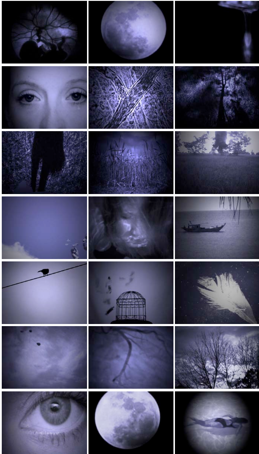
Figure 4: Emy Mixon, The Lightness of Being (still clips), 2008. Digital Video.