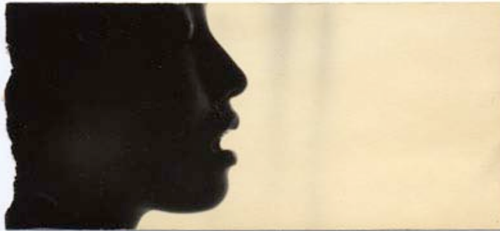
Figure 9: Masao Yamamoto, #1141. Silver Gelatin Photograph.