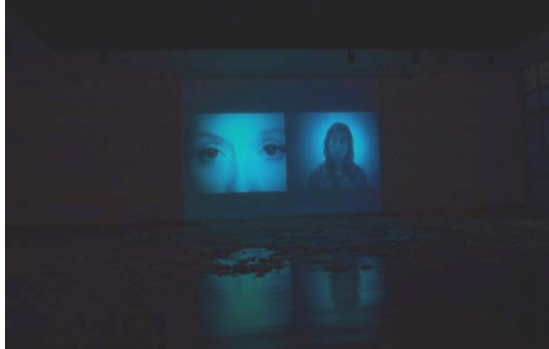
Figure 1: Emy Mixon, Installation Detail, The Lightness of Being & The Burden of Gravity , 2008. Mixed Media Installation.