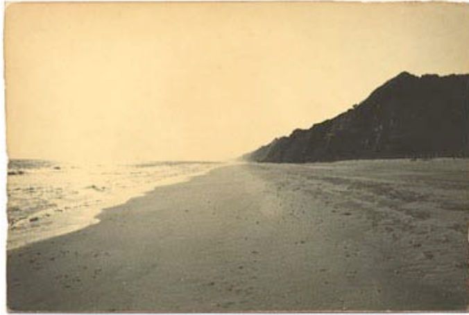
Figure 8: Masao Yamamoto, #817. Silver Gelatin Photograph.