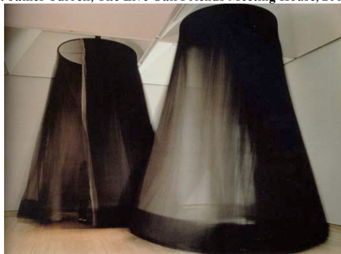
Figure 12: Ann Hamilton, (bearings) , 1996. Mixed Media Installation.