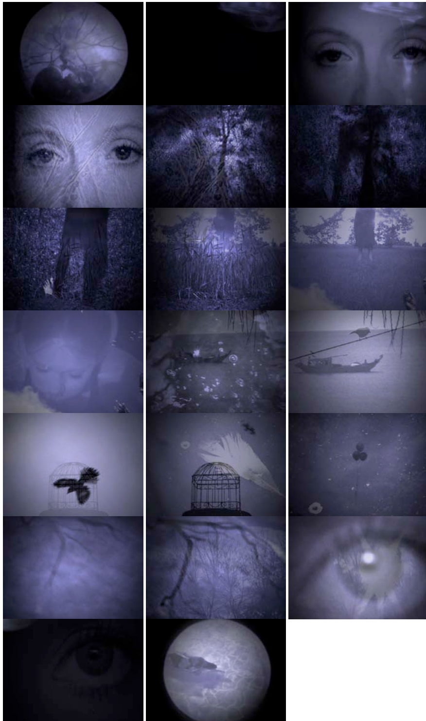
Figure 5: Emy Mixon, The Lightness of Being (still clips), 2008. Digital Video.