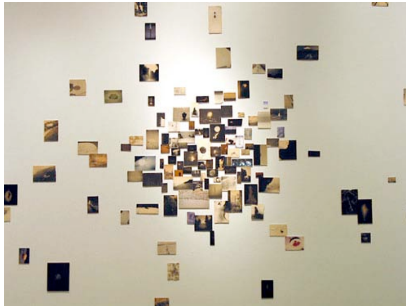
Figure 10: Masao Yamamoto, Nakazora , 2003. Photographic Installation.