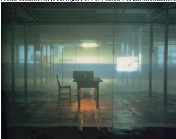
Figure 13: Ann Hamilton, ghost... a border act , 2000. Mixed Media Installation.