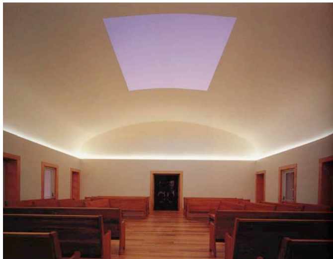
Figure 11: James Turrell, The Live Oak Friends Meeting House , 2000.