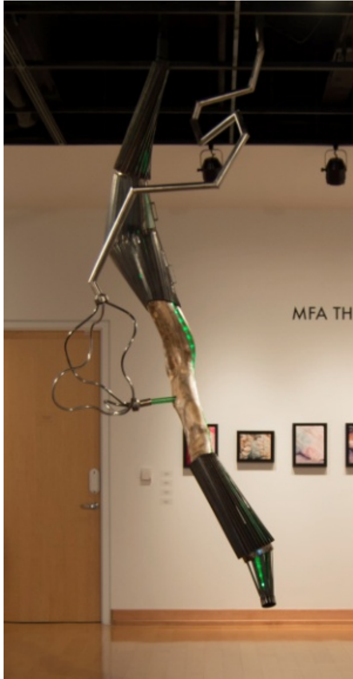
Figure 7, Title: MACHINE MARX, 11'x 6'x 6' Wood, Resin, Steel, Nuts, Bolts and LED lights, FALL 2014