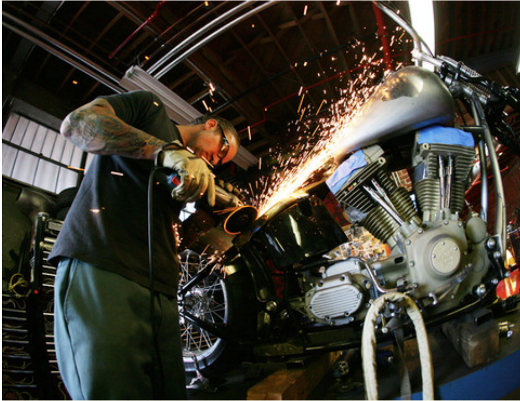
Figure 18, Jesse James, Auto and Motorcycle Custom Fabricator, sample from web, (Photo courtesy of: http://www.westcoastchoppers.com ). Accessed April 5, 2015 Page 35