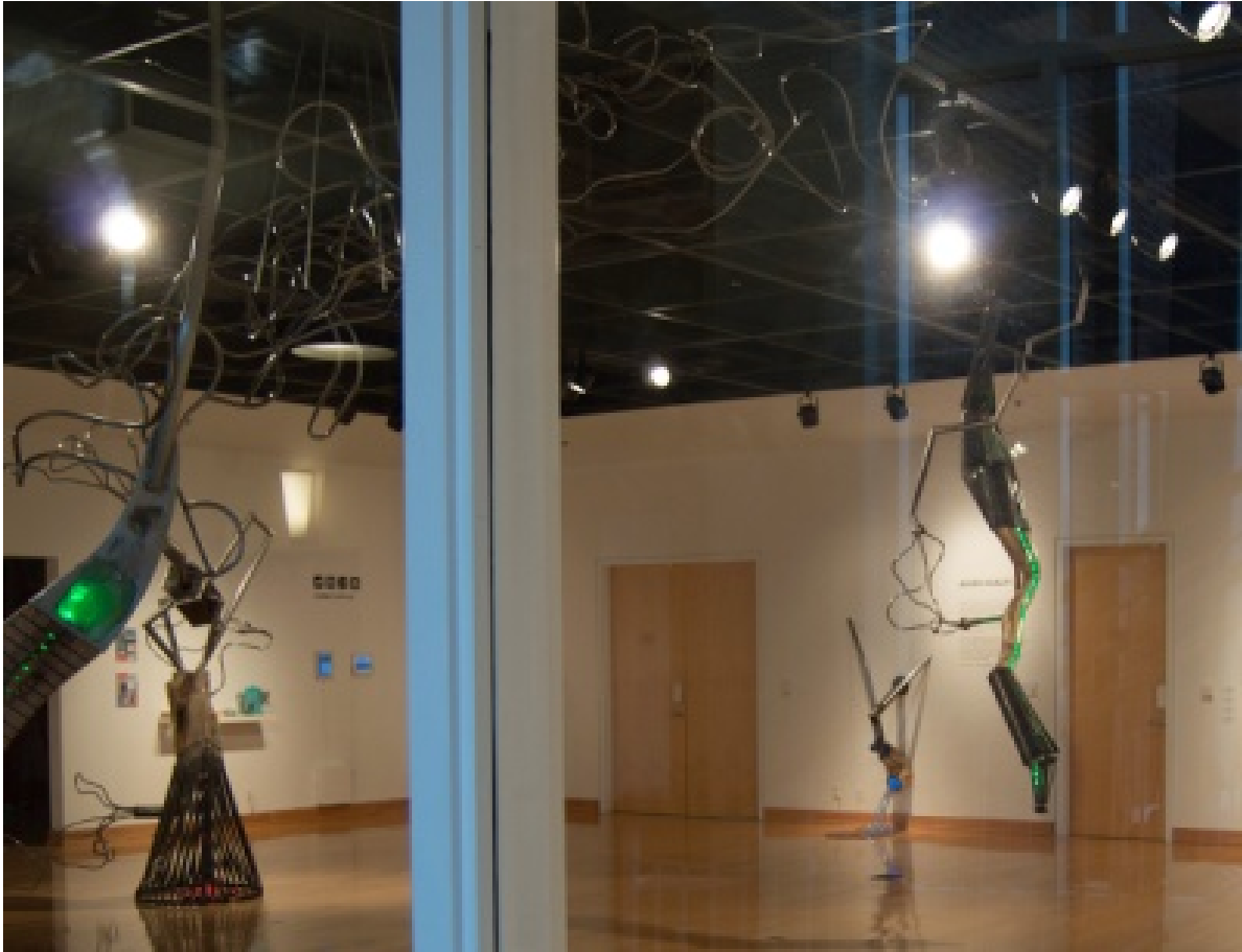
Figure 15, Aggro Duality, Gallery View, Spring 2015