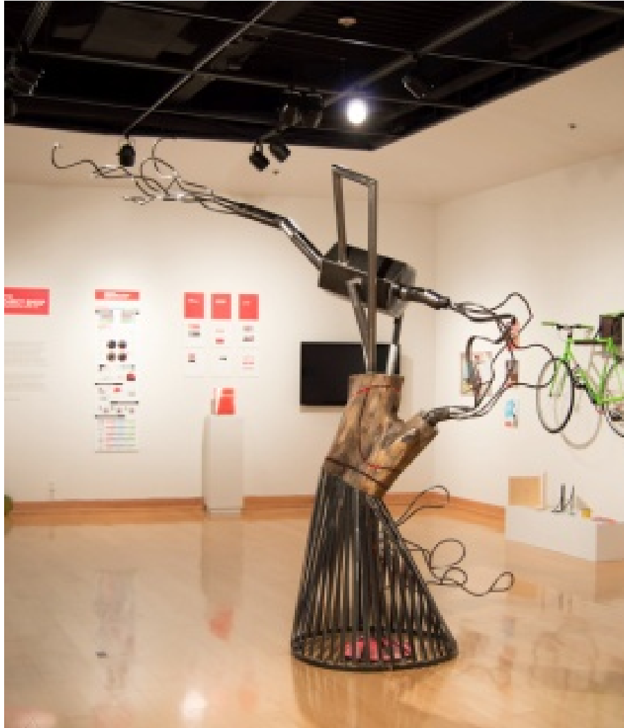
Figure 13, MACHINE FLOW, 12'x10. 5'x5' Wood, Resin, Steel, Led Lights, Bolts And Plexiglas, Spring 2015