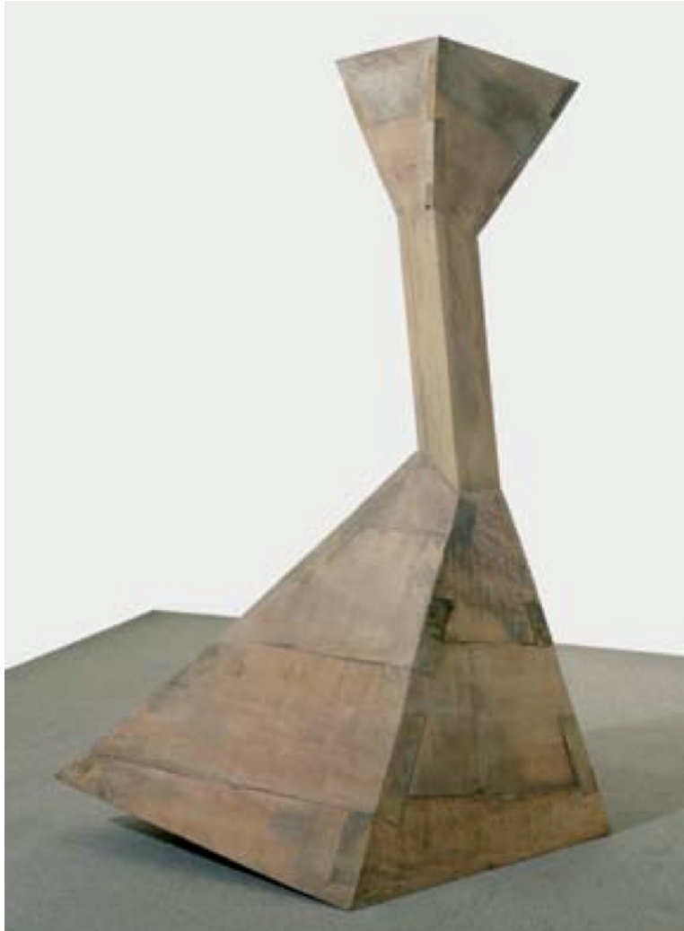
Figure 21, Martin Puryear, Timber's Turn , 1987, Honduras Mahogany (7' 2.5" x 3' 10.75" x 2' 10.5") (Photo courtesy of: Smithsonian Institution, Washington, DC. Photo Lee Stalworth).