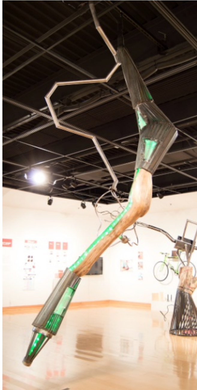
Figure 6, Title: MACHINE MARX, 11'x 6'x 6' Wood, Resin, Steel, Nuts, Bolts and LED lights, FALL 2014