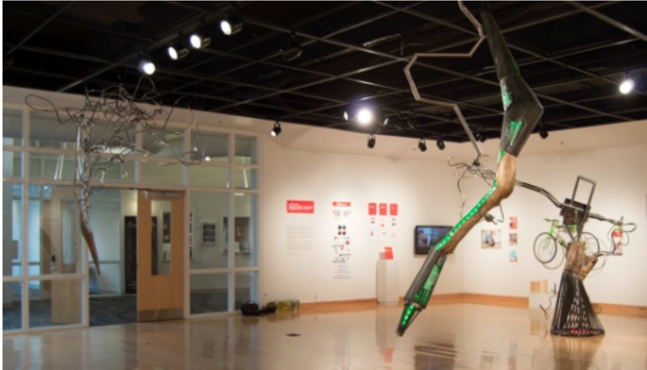
Figure 16, Aggro Duality, Gallery View, Spring 2015