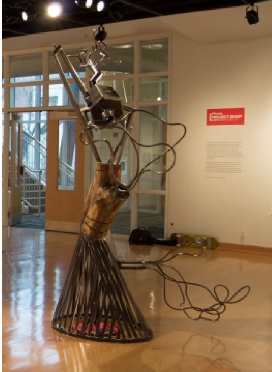
Figure 14, MACHINE FLOW, 12'x10. 5'x5' Wood, Resin, Steel, Led Lights, Bolts and Plexiglas, Spring 2015