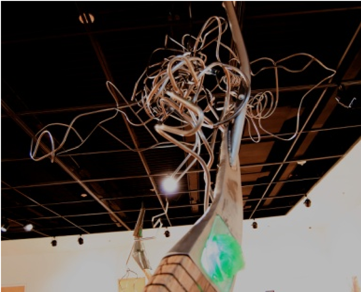
Figure 3 Title: BIOMORPHED, 10.5'x12'x 9', FALL 2014 Wood, Resin, Steel, Nuts, Bolts and LED lights