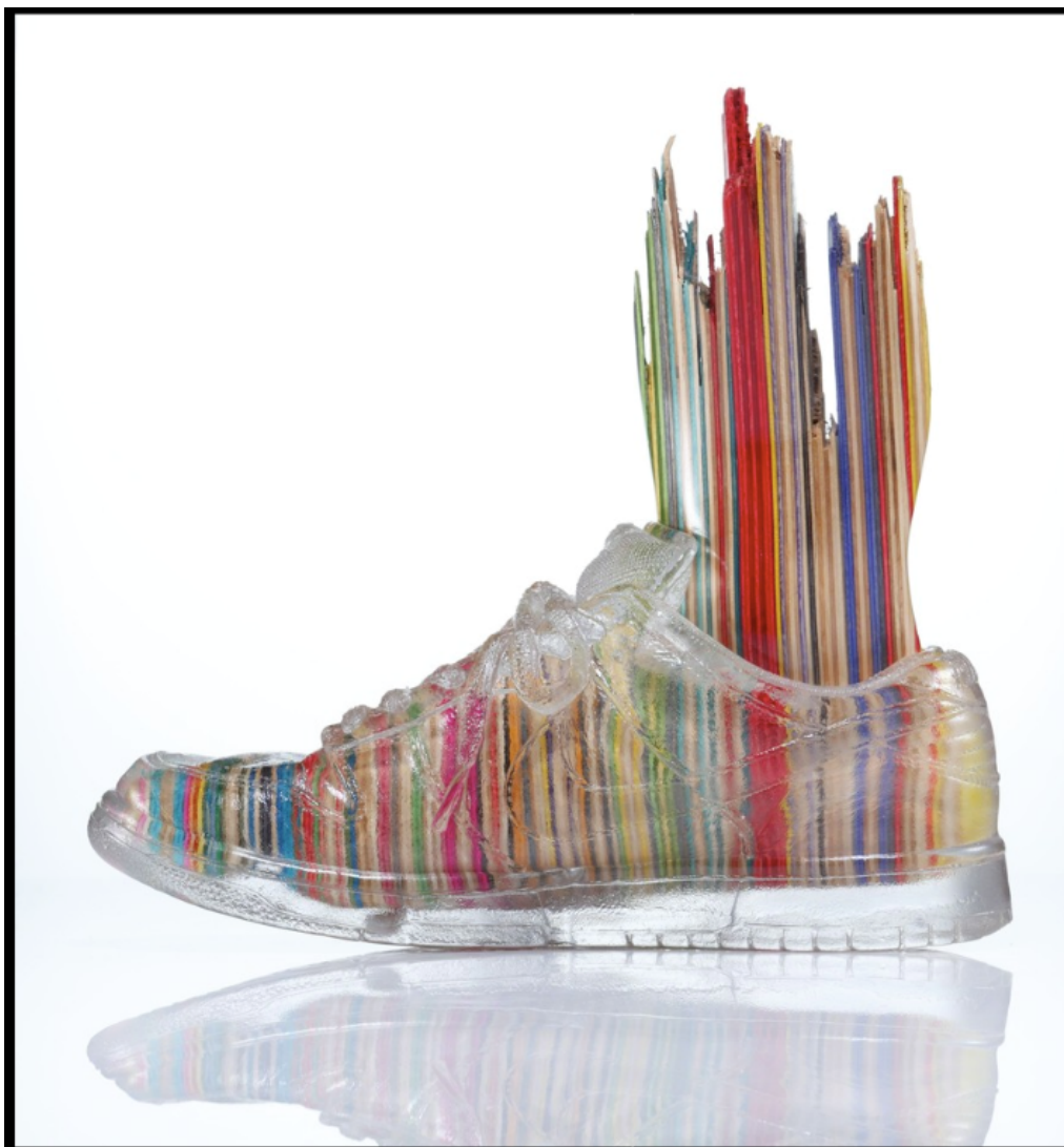
Figure 19, HAROSHI, Foot with Invisible Shoe 2 , 2012, Used Skateboards (23.5 x 12 x 28 in), (Photo courtesy of: Jonathon Levine Gallery, New York)