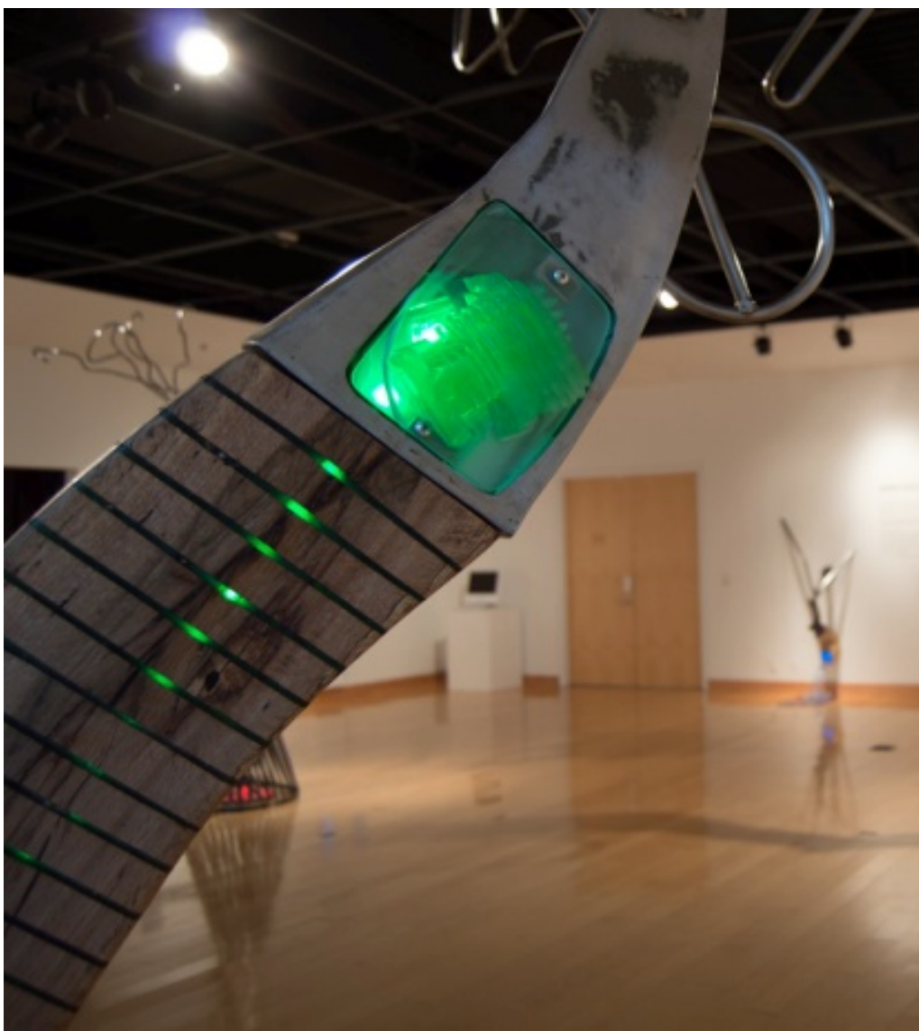
Figure 4 Title: BIOMORPHED, 10.5'x12'x 9', FALL 2014 Wood, Resin, Steel, Nuts, Bolts and LED lights