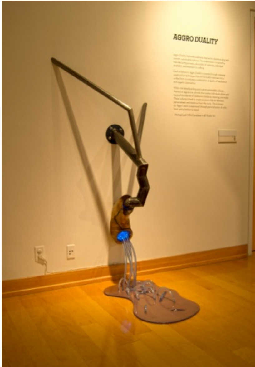
Figure 9, Title: BLUE OOZE, 72" x36" x36" Wood, Resin, Steel, Nuts, Bolts and LED lights, FALL 2014