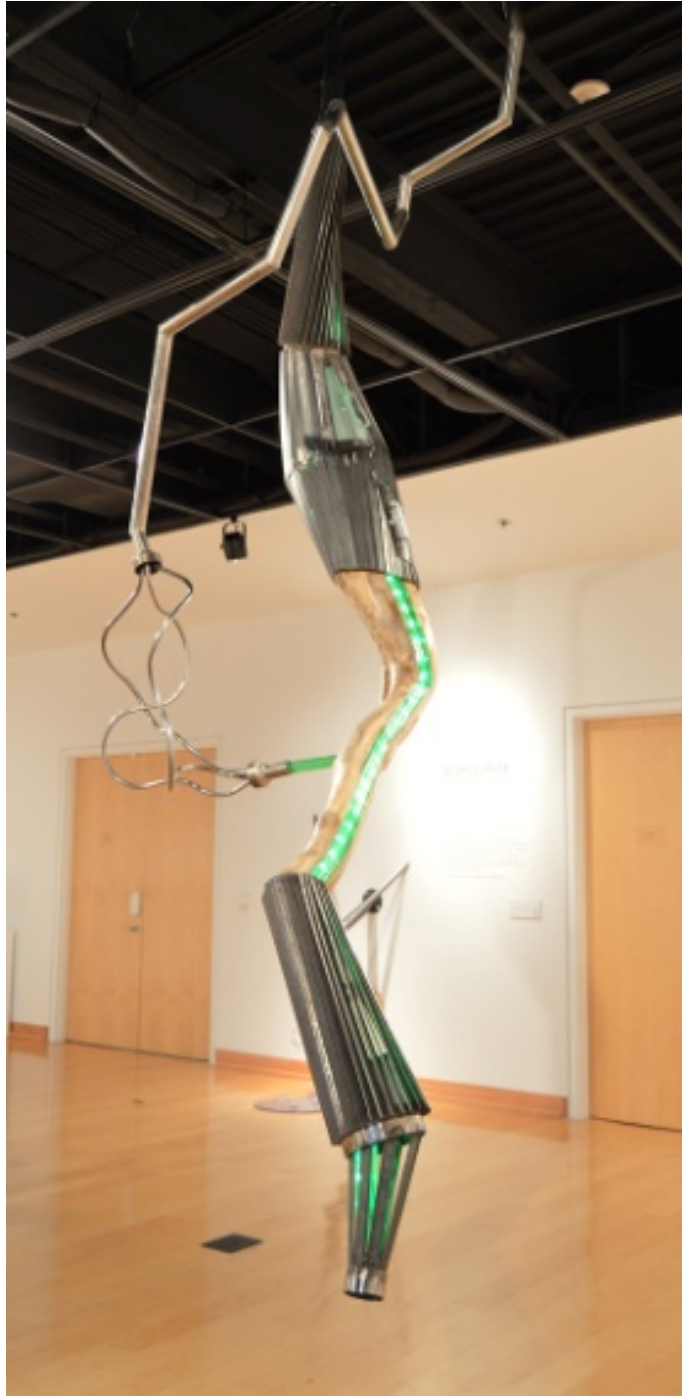
Figure 5, Title: MACHINE MARX, 11'x 6'x 6' Wood, Resin, Steel, Nuts, Bolts and LED lights, FALL 2014