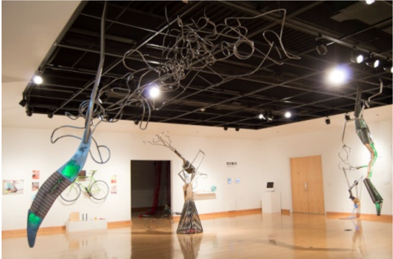
Figure 17, Aggro Duality, Gallery View, Spring 2015