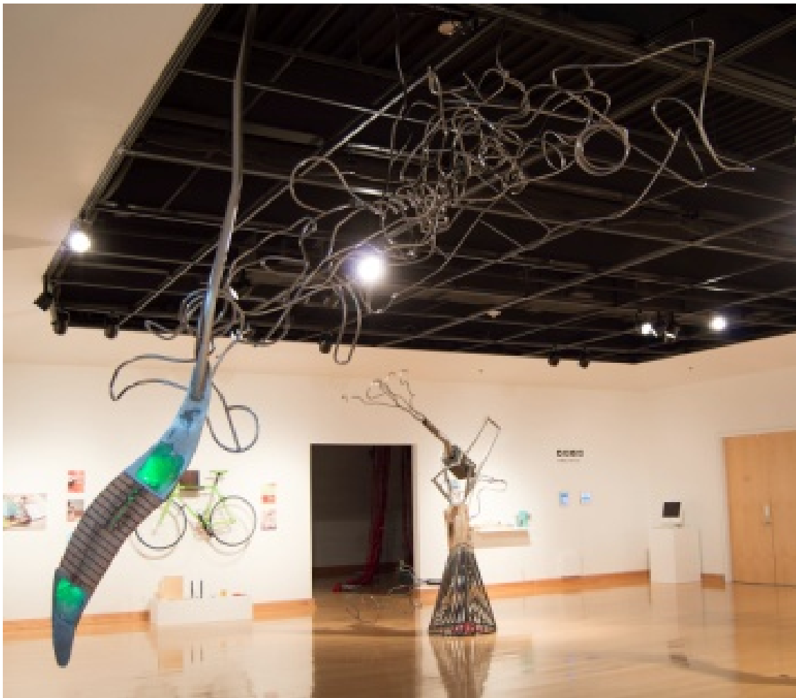
Figure 2 Title: BIOMORPHED, 10.5'x12'x 9', FALL 2014

Wood, Resin, Steel, Nuts, Bolts and LED lights