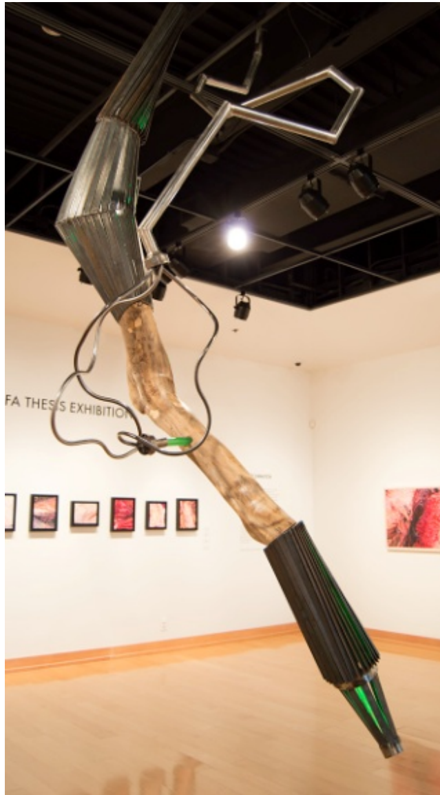
Figure 8, Title: MACHINE MARX, 11'x 6'x 6' Wood, Resin, Steel, Nuts, Bolts and LED lights, FALL 2014