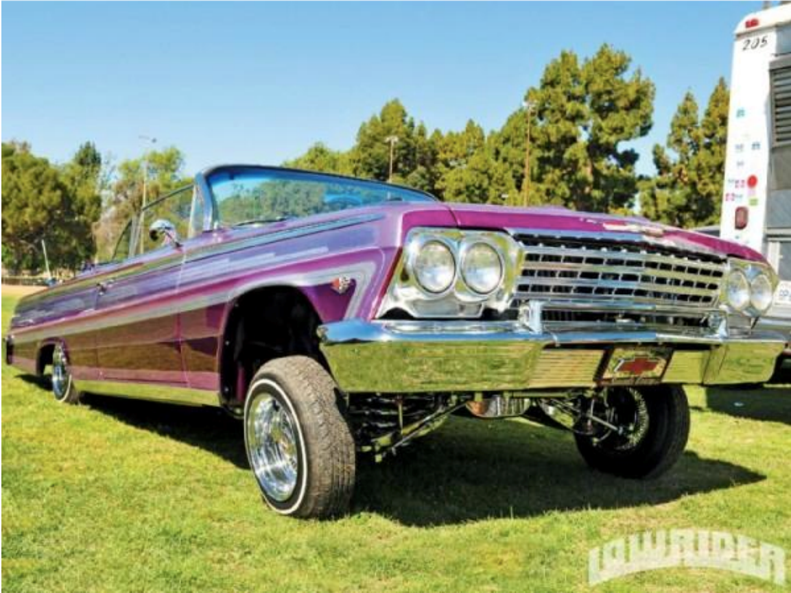
Figure 20, Low rider car Image, Reds Hydraulics, (Photo courtesy of: http://my-first-blog-a.blogspot.com/2012/01/photos-by-jaebueno-for-lowrider.html ). Accessed April 5, 2015