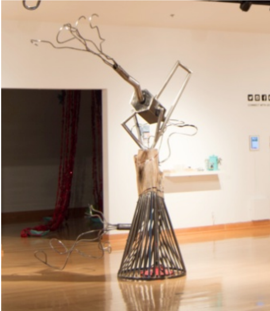
Figure 12, MACHINE FLOW, 12'x10. 5'x5' Wood, Resin, Steel, Led Lights, Bolts and Plexiglas, Spring 2015