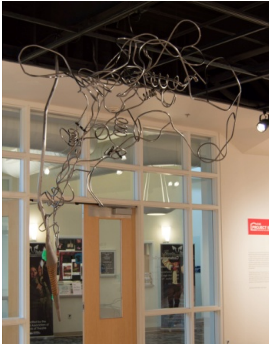
Figure 1, Title: BIOMORPHED, 10.5'x12'x 9', FALL 2014 Wood, Resin, Steel, Nuts, Bolts and LED lights