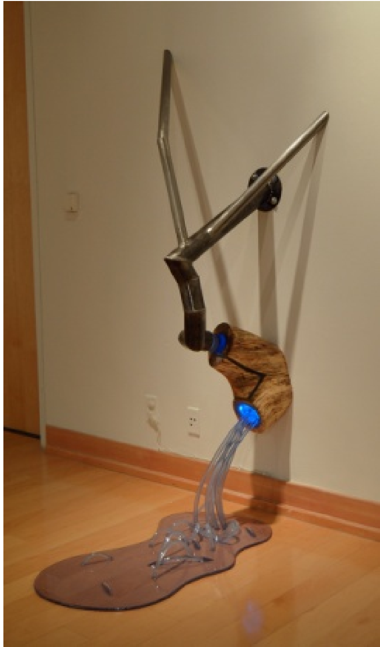
Figure 10, Title: BLUE OOZE, 72" x36" x36" Wood, Resin, Steel, Nuts, Bolts and LED lights, FALL 2014