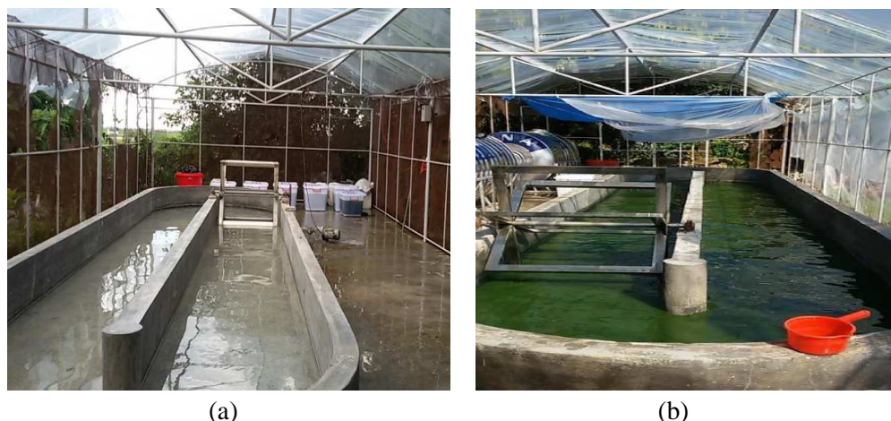
(a) (b) Figure 3. The raceway tank before (a) and during algal cultivation (b).

The OD was measured every three days in order to evaluate the growth and productivity of Spirulina platensis . Figure 4 illustrates the results of OD taken at 445 nm wavelength.