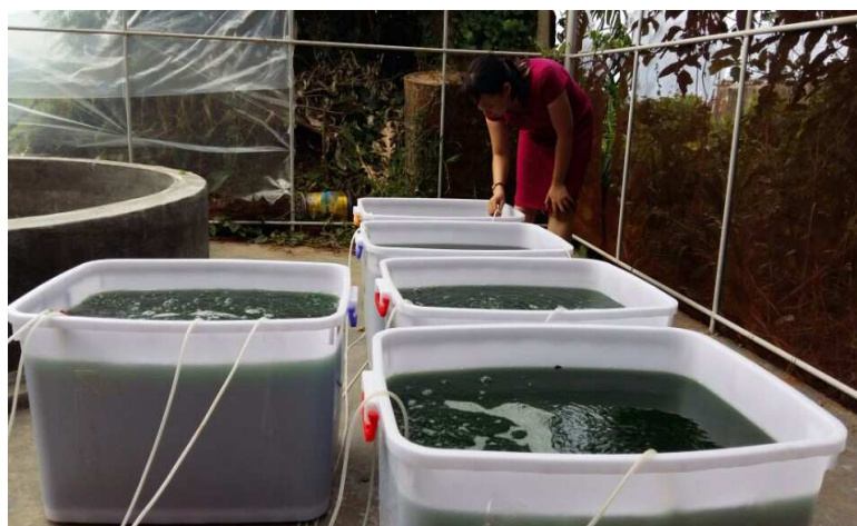
Figure 2. Growth of algae in plastic container of 200 L.

Step 2: Preparing cultivation medium, and then transferring it into the raceway tank (Figure 1). New nutrient medium should be gradually added to the tank for alga adaptation to new condition during this process until the algal suspension reached 6 \text{ m}^3 . The temperature, pH, and water level were monitored everyday (Figure 3).