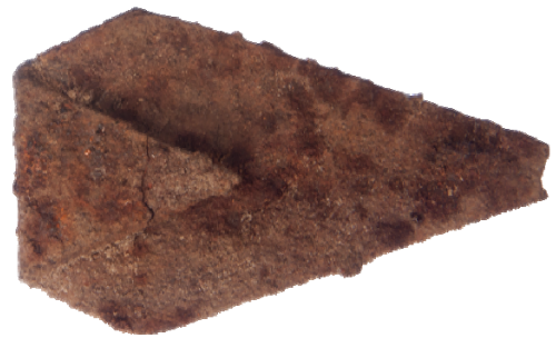
Figure 23. 3 rd Corps Badge.

An interesting grouping of artifacts was found along a 5.1m area of transect 027. A total of eight fragments of iron wire seem to be related. These items seem to have been shaped and sharpened to use as tools as seen in Figure 24. While some of the “tools” seem to be similar in construction, it is not known what purpose they could have served. It is possible that these artifacts could indicate the location of an abandoned tool kit which has been scattered by plowing, or possibly of an area where prisoners manufactured or repaired some type of good for other prisoners.