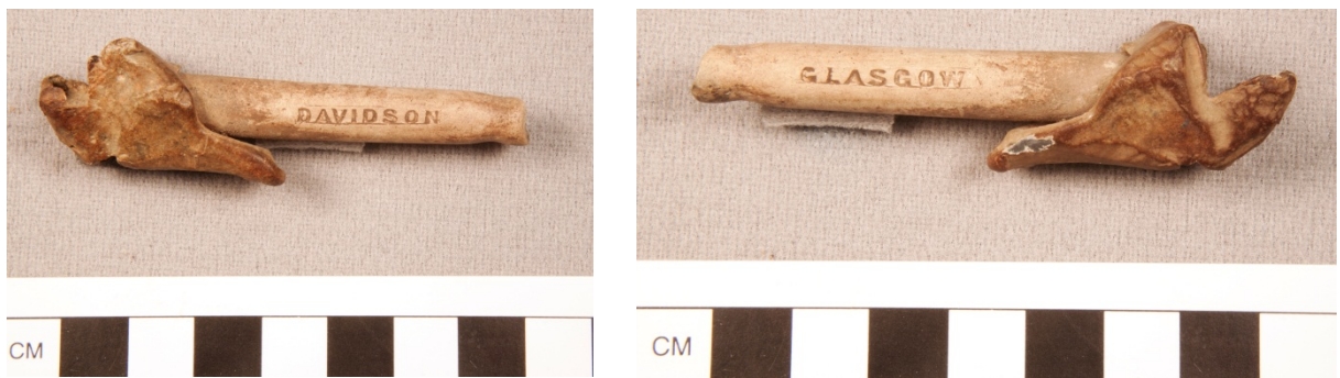
Figure 25. Improvised Tobacco Pipe showing the makers marks on each side.

Improvised Tobacco Pipe – The pipe, Figure 25, consists of a short length of white clay pipe stem which has been recycled for use by attaching a bowl cast of lead. The stem is marked with “Glasgow” on one side and “Davidson” on the opposite. The pipe is almost certainly of prisoner manufacture. The use of the pipe is testified to by the grooves worn by the smoker’s teeth in the bit of the stem.