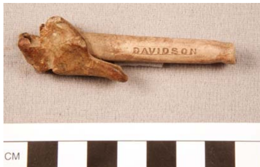
Figure 17. Improvised tobacco pipe.

An additional 85 artifacts were recovered whose affiliation cannot be readily assigned. Most of these are highly corroded iron wire, strapping, thin plate, or fragments. A few are amorphous non-ferrous splashes which may indicate the casting of lead. At least one artifact has been recovered which demonstrates that casting of lead by prisoners. An improvised tobacco pipe (FS#56), Figure 17, was recovered which was made from a short length of white clay pipe stem onto which a replacement lead bowl was cast.