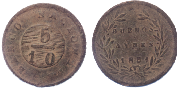
Figure 35. 1834 Argentinian Half-Real.

Argentinian Half Real – This 1834 Argentinian Half-Real coin, Figure 35, was found at Camp Lawton. It is one of two examples of foreign currency found so far.