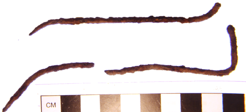
Figure 24: Possible tools made from iron wire.

An interesting grouping of artifacts was found along a 5.1m area of transect 027. A total of eight fragments of iron wire seem to be related. These items seem to have been shaped and sharpened to use as tools as seen in Figure 24. While some of the “tools” seem to be similar in construction, it is not known what purpose they could have served. It is possible that these artifacts could indicate the location of an abandoned tool kit which has been scattered by plowing, or possibly of an area where prisoners manufactured or repaired some type of good for other prisoners.