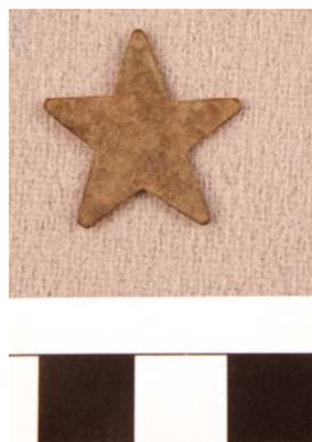
Figure 40. Hand cut brass star.

Hand Cut Brass Star – This five point brass star, Figure 40, appears to be hand cut and not the product of industrial manufacturing. The badge may be a gaming piece, parole star, or a Corps badge. The five point star was the emblem of the Union 12 th and 20 th Corps. The 12 th Corps initially used the five point star as its emblem, but when the 12 th Corps merged into the 20 th Corps, the 20 th also adopted it.