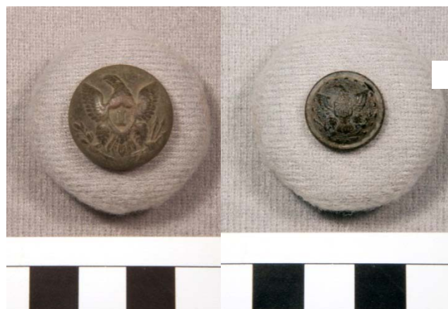
Figure 38. Military issue buttons.

Military Issue Buttons – Two of the thirty military issue buttons. The button on the left, Figure 38, is a coat sized button with the early war design, having the branch initial in the shield, in this case “I” for infantry. The button on the left is a later war “General Service Eagle” design which was used by all branches.