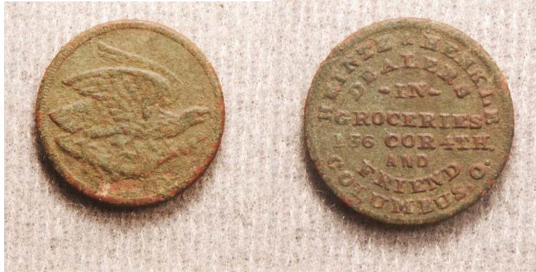
Figure 31. Heintz and Henkle trade token.

Heintz and Henkle Trade Token – A privately minted coin worth 1 cent and the size of the modern cent. Called a store card token because of the advertisement of the distributors business on the reverse of the coin, Figure 31. Reverse reads “Heintz & Henkle Dealers in Groceries 136 Cor 4 th and Friend Columbus O.”