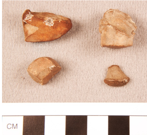
Figure 37. Cut bullets.

Cut Bullets – Lead bullets such as these, Figure 37, may have been used by prisoners as a source of lead for the manufacture of goods such as the Improvised Tobacco Pipe or as gaming pieces.