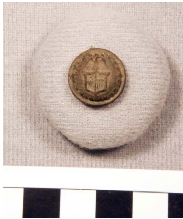
Figure 39. New York State Button.

New York State Button – This button, Figure 39, was of a type issued only to soldiers serving in state regiments. State regiments were raised and outfitted by a state, such as New York. Some of these regiments would have unique uniforms, especially early in the war. This button has the New York State Seal and state motto “Excelsior.”