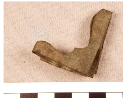
Figure 26. Ambrotype picture frame.

Ambrotype Picture Frame – The ambrotype picture was a photographic method popular during the late 1850s and mid-1860s. In this process an image was captured on a thin sheet of glass. The brass frame, Figure 26, has been carefully folded into quarters.