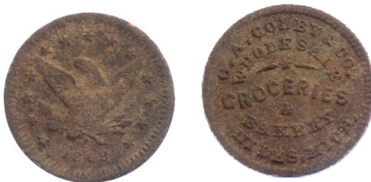
Figure 32. C.A. Colby & Co. trade token.

C.A. Colby & Co. Trade Token – Much like the above token, this one, Figure 32, is from Niles Michigan and reads: “C.A. Colby & Co. Wholesale Groceries & Bakery Niles, Mich.”