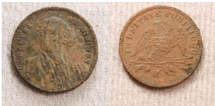
Figure 34. George Washington Token

George Washington Token – Produced in Germany in the 1850s, this gaming token, Figure 34, is the size of a U.S. small cent and would likely have been used as one. The reverse reads “In Unitate Fortitudo” or Strength in Unity. Marked “Speil Munze” or Game Money.