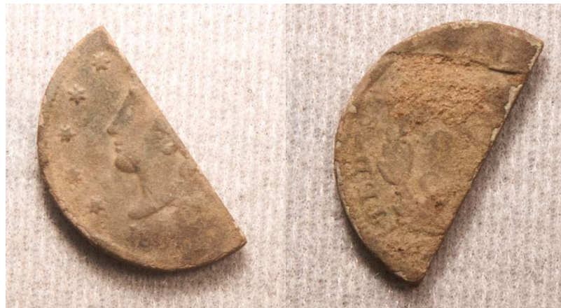
Figure 30. 1835 US Large Cent.

1835 US Large Cent – This large cent, Figure 30, was altered by intentionally cutting it almost exactly in half. The purpose of cutting the coin is unknown but may include devaluation.