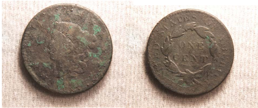
Figure 29. 1824 US Large Cent.

1824 US Large Cent – The one cent in prior to 1857 in the United States was close to the size of the modern dollar coins, Figure 29. The large cent was replaced in 1857 with a cent similar in size to the current coin.