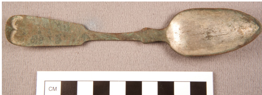
Figure 28. Silver amalgamated spoon.

Silver Amalgamated Spoon – This spoon, Figure 28, was made by stamping out the form in a base metal, such as copper or a copper alloy, and applying a thin layer of silver. This produced a cheaper piece of flatware with the look of the more expensive silver flatware. This spoon was not military issue. Thirty-three utensils, mostly of simple iron manufacture, have been found.