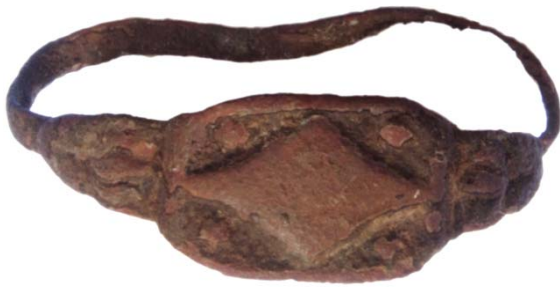
Figure 22. Ring with 3 rd Corps Emblem.