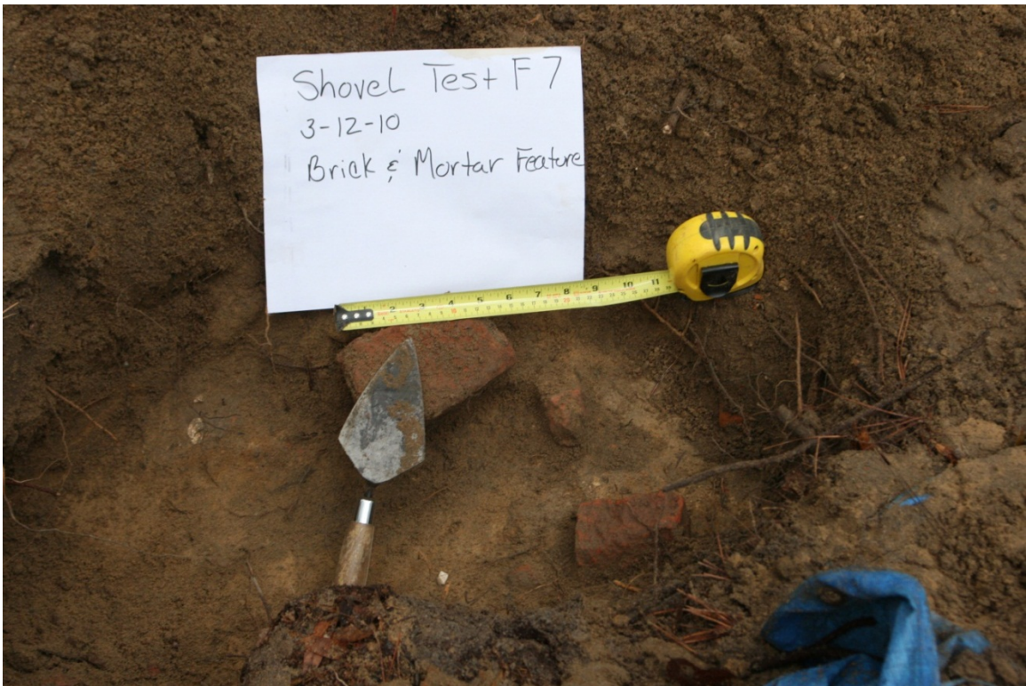
Figure 15. Shovel Test F-7 – Bricks and mortar in situ.

The ten positive shovel tests which did not yield a clear indication of Civil War occupation did, however, yield some interesting information. Six of the positive shovel tests did yield some amount of brick. These bricks may be historic and may relate to a Civil War usage of the site. It is known that a number of brick ovens were built at the site and that bricks were stolen from the ovens and used by prisoners to construct their shebangs. (Derden, 2011; Sneden, 2000; Sneden, 2001). Of particular interest was shovel test F-7, Figure 15, where bricks were found that appear to still be in situ.