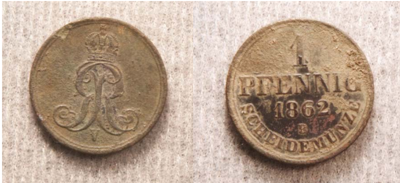
Figure. 1862 Austrian Pfennig.

1862 Austrian Pfennig – The size of a U.S. small cent, this coin, Figure 33, would have likely passed as such in the American economy.