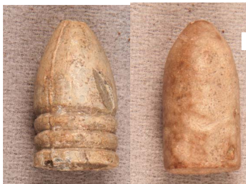
Figure 36. Intact Minié balls,

Intact Minié Balls – The left bullet, Figure 36, is an unfired .58 cal. 3-band Minié ball. The clipped nose and heavy mold line marks it as likely Confederate. The right bullet is an unfired Enfield bullet, also in .58 cal. Though used by both sides, the 1853 Enfield rifle was a common Confederate fire arm. These bullets, found in the prisoner occupation area, may have been traded to the prisoners by guards.