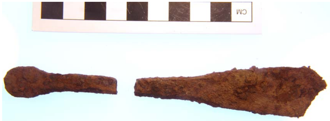
Figure 20. Two halves of a broken spoon.

Along the individual transects clusters of artifacts can be recognized. Some of the artifacts seem to be related in pairs or groupings. These groupings of artifacts have the possibility of indicating where particular activities took place in the stockade, where individuals belonging to a particular unit congregated, and how the artifacts have moved in the plowzone over the last 150 years.