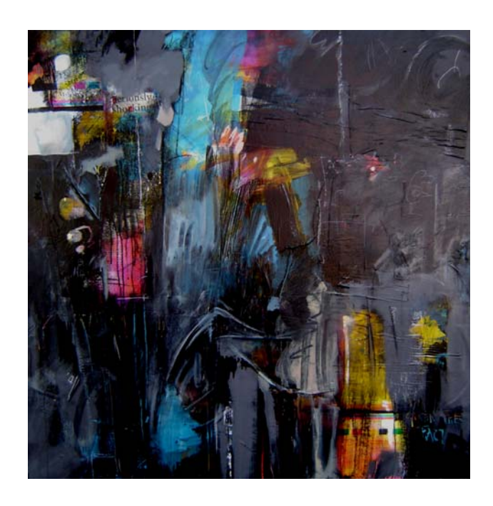
Figure 5: Christopher Murphy, Dark Matter, 2007

ponder the image even though it may seem impossible to penetrate. In some ways the act of asking a question that causes one to deliberate recalls stories from Eastern philosophies. Zen Buddhist Masters are said to ask questions, called Koans, of their students that are seemingly impossible to answer; for example, "What is the sound of one hand clapping?"<sup>20</sup>