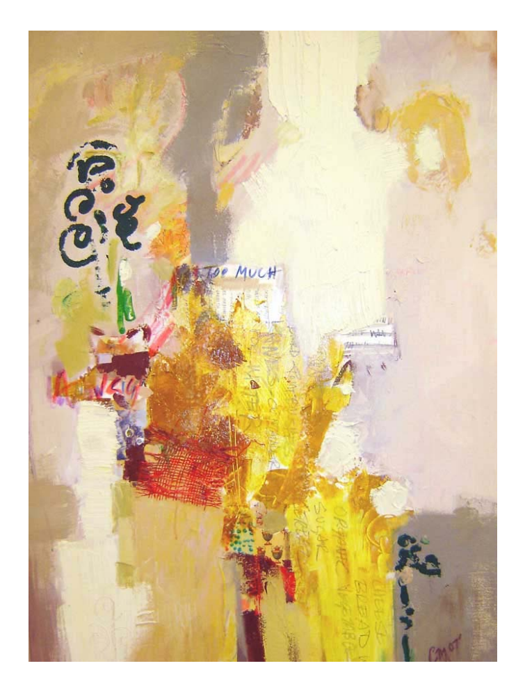
Figure 10: Christopher Murphy, Daytime Drama, 2007

A third movement which has influenced my work is Neo-Expressionism, which is characterized by intense subjectivity of feeling and an aggressive raw use of materials. The similarities between my work and the Neo-Expressionist paintings are that both are typically large and rapidly executed. Sometimes found objects are embedded in the surfaces. Differences are found where my work tends to be more introspective with broad overarching themes and Neo-expressionist subjects are often violent with doomladen figurative themes.