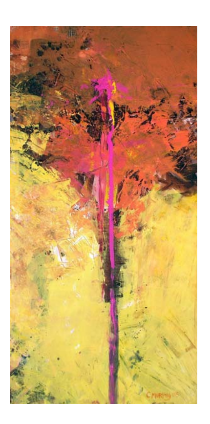
Figure 2: Christopher Murphy, Severed Union, 2005

Severed Union (Fig. 2) is a non-objective work in the tradition of early 20<sup>th</sup> century abstractionists like the German Expressionist, Vassily Kandinsky. The symbolic use of color and form as a means to represent emotions and ideas is significant in this work. Severed Union's composition signifies a division between the natural and the artificial world. The separation of these two worlds reveals itself in the synthetic pink slash across the more organic forms behind it. While I have stated my intent with Severed Union it would not likely be obvious to the viewer. It certainly is not my goal to make the viewer passive by having them rely on my explanation of the work for a judgment or interpretation.