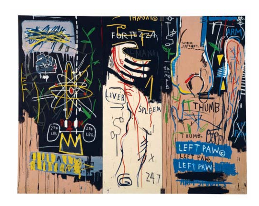
Figure 11: Jean-Michel Basquiat, Catharsis, 1982

condition. Basquiat and I both express an interest in connecting art and life and communicating our experiences within it.