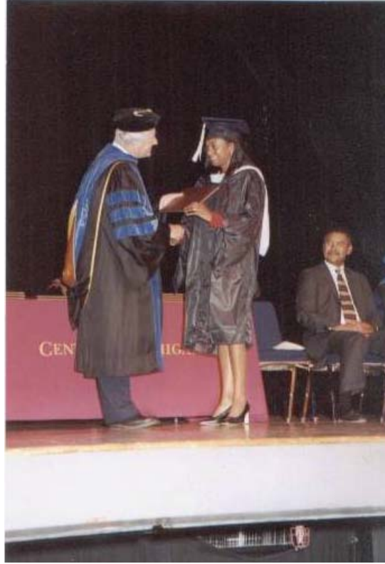
Figure 6: Me receiving a Master's Degree in the fall of 2002.