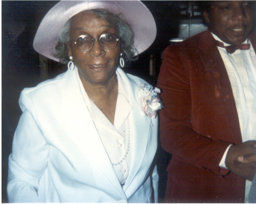
Figure 2: Gramps and Uncle Joe.

Throughout my life my grandmother could read and write even though she came from a time when Black people were restricted from an education.