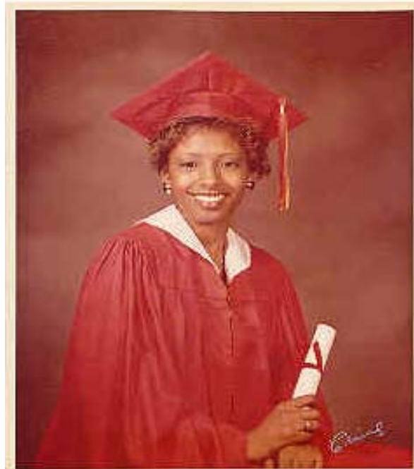
Figure 5: My high school graduation in Detroit, Michigan, June 1977.