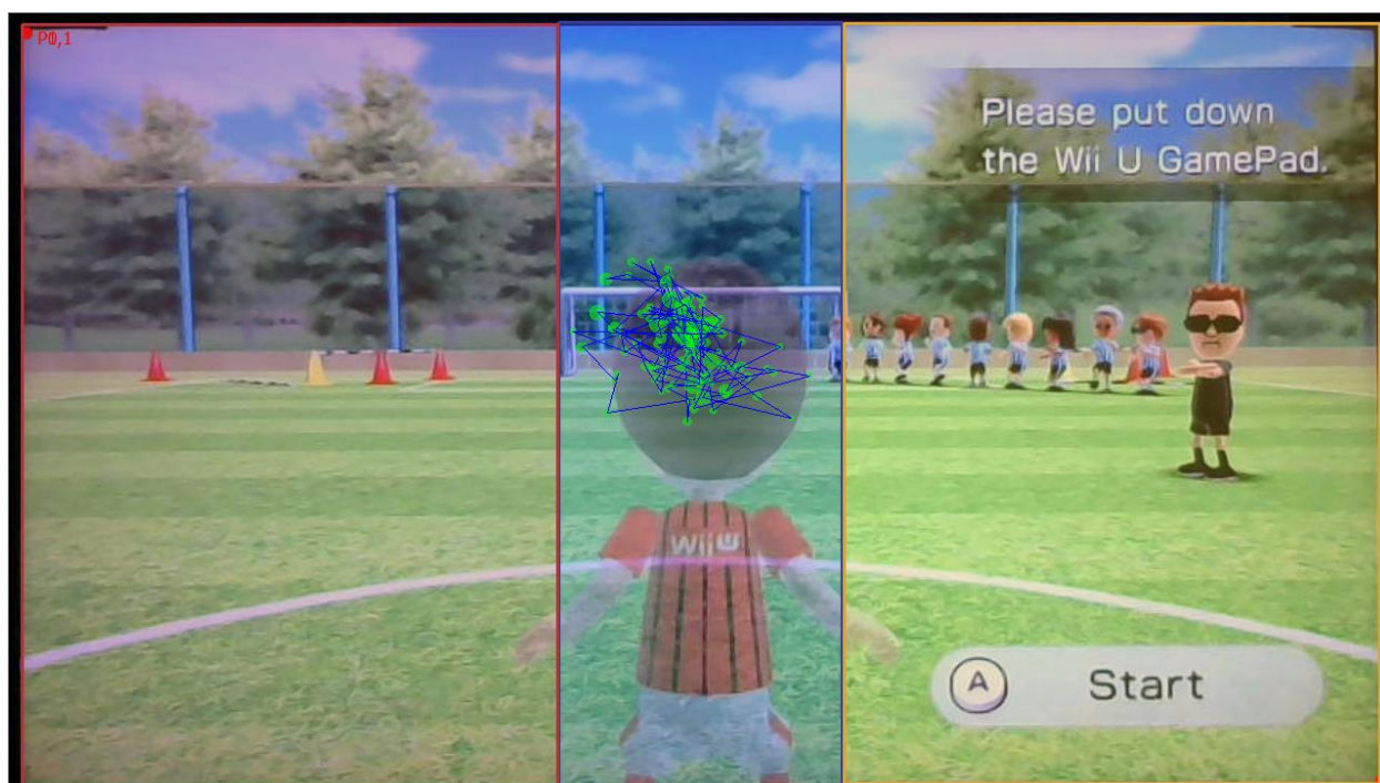
Figure 2. WiiFit Soccer Heading game: the TV screen is broken into center (blue), left (red), and right (yellow) areas of interest to determine gaze deviations away from the center (total amount of anti-saccades, total duration of anti-saccades, and average duration of each anti-saccade) between PC and MC. Each green dot represents a gaze fixation point (points in which the eye is focusing) and the blue lines represent the path of the participant's eye movements.

Every gaze deviation away from the center area of interest was considered an anti-saccade. At that point, the soccer ball being tracked had gone outside of the goal posts and the next soccer ball was kicked from within the center area of interest. Participants should inhibit their gaze on the current soccer ball and make a rapid eye movement toward the new incoming soccer ball. If this did not occur, then the participants were making a reflexive gaze deviation away from this new soccer ball by continuing to track the current soccer ball (anti-saccades). The ASL Eye Tracker sampled these anti-saccade data at a frequency of 240Hz.