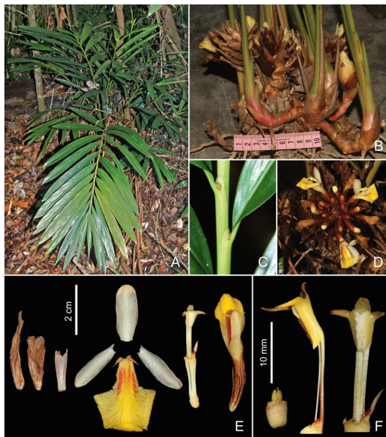
Figure 2. Conamomum odorum . A. Habit. B. Rhizome and inflorescences. C. Ligule. D. Inflorescence. E. Flower dissection. F. Ovary with epigynous glands and anthers (side and front views)

yellow with median red bands at base, reflexed, trilobed; lateral staminode minute, linear, ca. 6 mm long, ca. 1 mm broad at base, acute towards apex, red at base, cream-yellow at apex, with few glandular hairs at base. Filament flat, 13 × 2.5 mm, yellow, sometimes with red tinge at base, anther yellow, ca. 11.5 × 4.5 mm (including crest), connective tissue full of glandular hairs; anther crest trilobed, yellow, glabrous, lateral lobes narrow triangular, ca. 6 × 1 mm, pointing downwards, central lobe semi-circular, ca. 3 × 3.5 mm; epigynous glands two, ca. 2 × 1 mm, yellow; ovary ca. 4 × 3.3 cm, cylindrical, cream, hairy, tri-locular, axile placentation. Stigma cup-shaped, yellow, ostiole ciliate; style ca. 33 mm, cream, sparsely hairy near apex. Fruits not seen (Fig. 2).