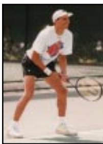
NCAA Division II Singles Champion 1992