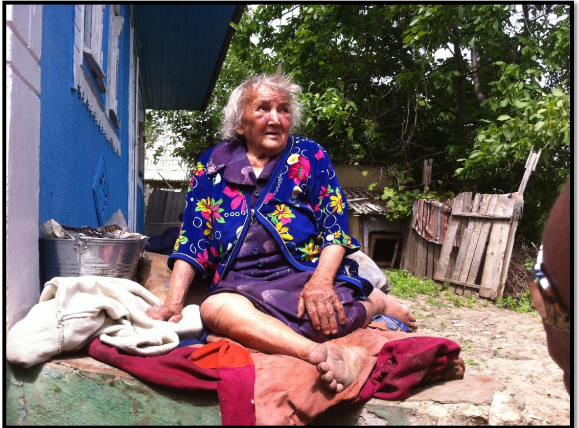
Elderly Woman Recounting the Soviet Union

anymore. She cannot work in her garden or make any kind of income to buy or trade for groceries. She is practically bed-ridden and places the blame on her former rulers. She told us that when she was younger, the Soviets saw Moldova as a great fertile bread basket of the USSR, so Moldovans were assigned the task of working night and day in the fields to secure bread. She claims that this strenuous workload has caused her practical paralysis today. Yet, people are giving more and more support back to this Communist Party. A political trend has developed in Moldova that could have very dangerous repercussions.