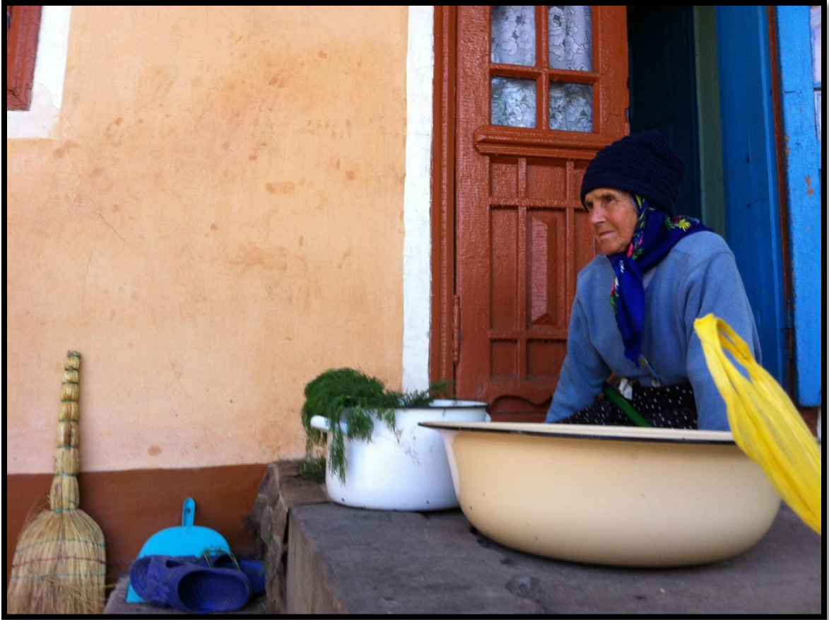
Preparing For Dinner