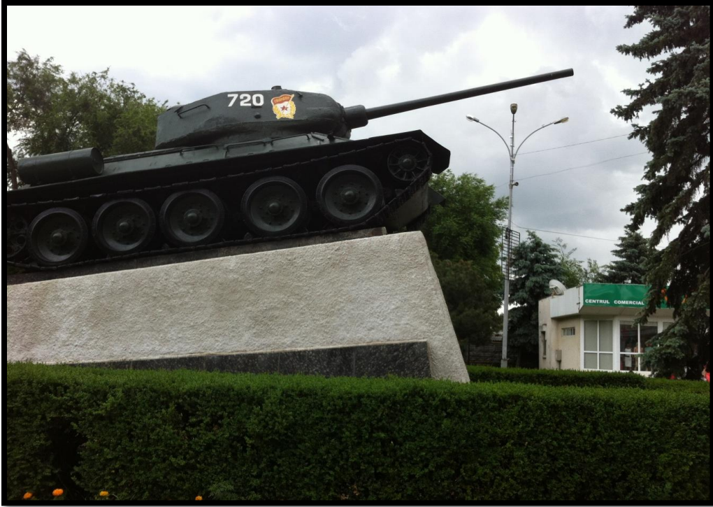
World War II, Soviet Tank