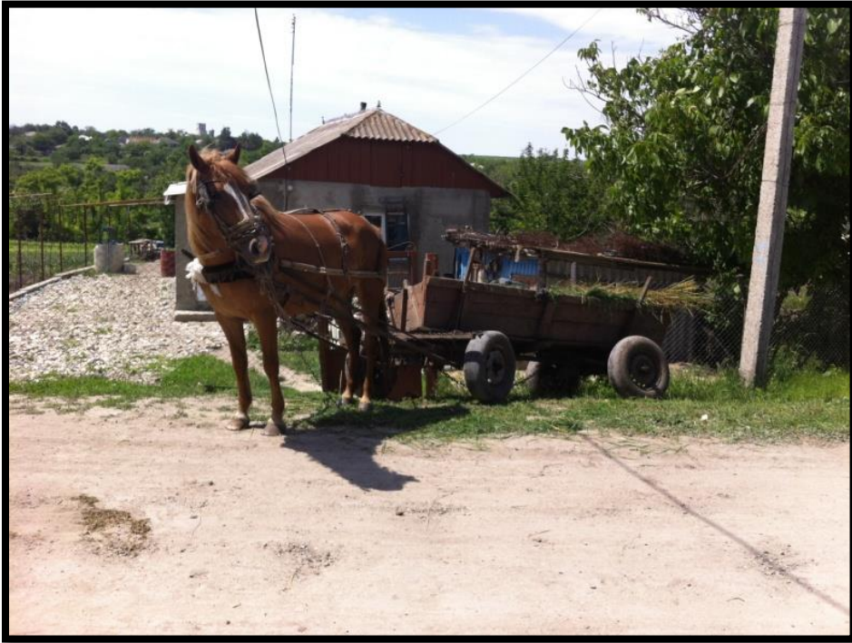
Transportation in one Moldovan Village