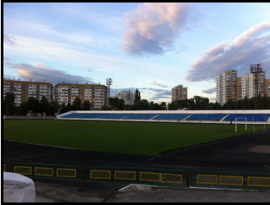
Soccer Stadium in Bălți