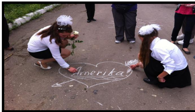
Moldovan Students Wishing Us Farewell

The last process is education reform. Many schools in Moldova are struggling to maintain teachers in classrooms and provide basic school items for the children, but a government funded initiative to send representatives to schools around the country and teach children what it means to be Moldovan could have massive payoffs. It is the duty of the government, when they cannot do it on their own, to reach out to NGO's for support. Children across the country are receiving the bare minimum education necessary for survival. The idea of any secondary or post-secondary education for children in the villages is a remote and sometimes absurd possibility. The children who do make it through the system and receive an education often times leave the country to find employment or larger universities and they never return. It is necessary to develop a curriculum that expands children's knowledge and teaches them to be proud of their heritage. The more pride you instill in children, the more likely they are to remain in Moldova after completing their education.