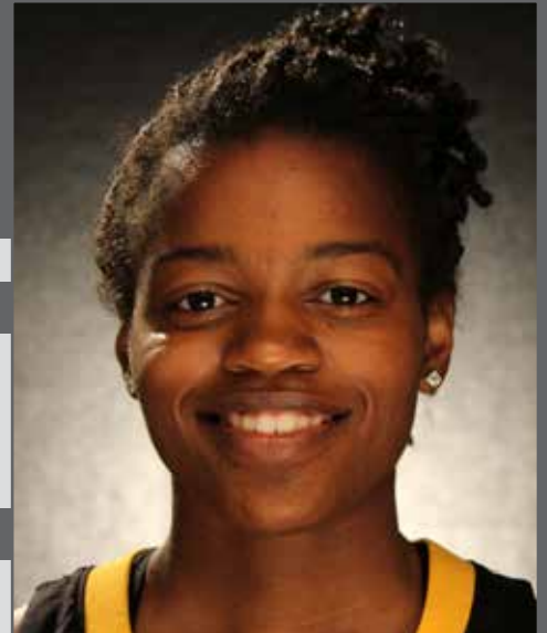
DAVIS' GAME HIGHS