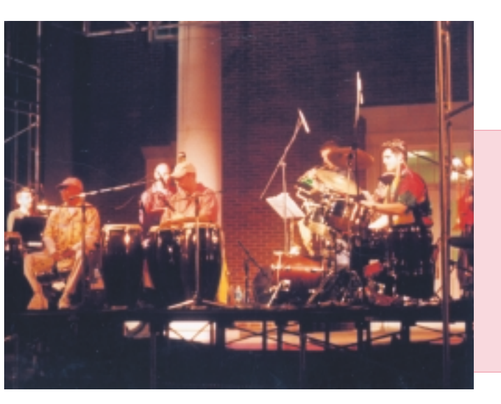
Olé. The award-winning Rumba Club from Miami brought Latin rhythms to the university quad. Hundreds of students, alumni, faculty, staff, and community friends gathered for an evening of dancing and international dining.