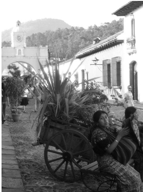
Selling to tourists in Antigua