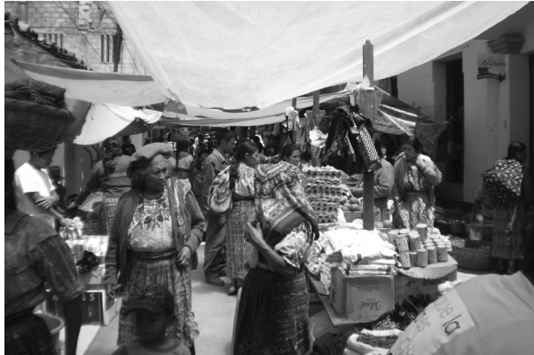
Market Day in San Francisco