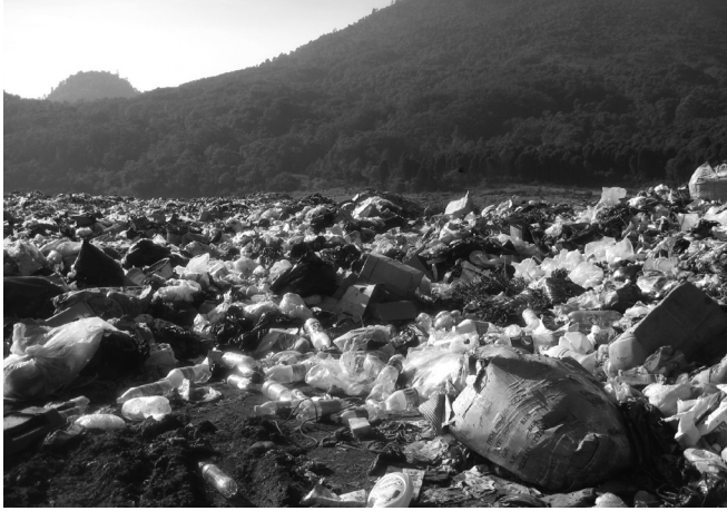
Unimproved landfills that contribute to surface and ground water pollution are common sights in Guatemala

In conclusion, Guatemala may not be at the bottom of the sustainability rankings and may have more than a fingernail grasp of a chance at a transition to a sustainable and resilient future, but the prognosis is not good.