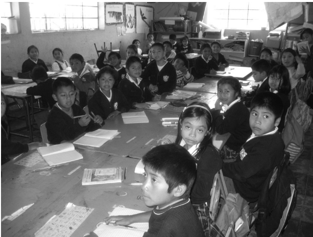
School children in Quetzaltenango