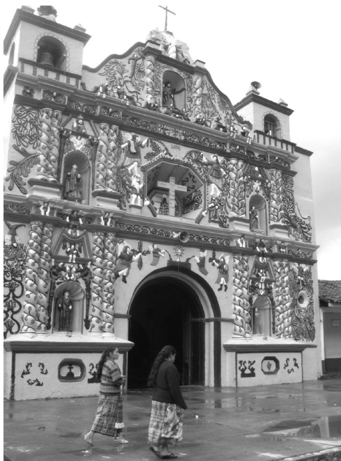
Church in San Andres Xecul

Protestant churches coexist with traditional Catholic churches, which show a mixture of Catholic and Indigenous art. We visited a small and a larger bright yellow church building at the top of a steep road with figures of leopards and angels dressed in shiny blue and red garb, mixed with the more recognizable Catholic saints and virgins. We also visited a more conventionally decorated colonial church, next to which was a Maya altar with a black cross, where we were told religious ceremonies are performed.