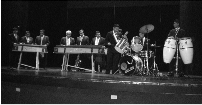
Marimba concert in Guatemala City

the concert's audience. One could see the embarrassment on the part of the concert's emcee when he lamented the declining interest among Guatemalans in the national musical form.