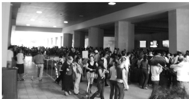
La Aurora International Airport, Guatemala City