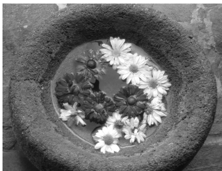
Décor at Universidad Rafael Landívar: Delicate flowers in volcanic stone bowl — good description for Guatemala!