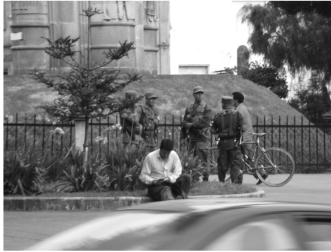
Soldiers in Parque Central, Quetzaltenango