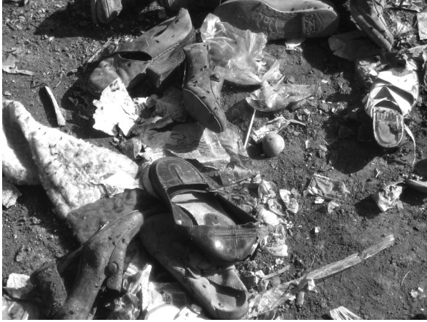
Landfill near Quetzaltenango

Perhaps the strangest part of the visit itself was not what they had done, but my reaction to it. I was moved by their dignity. Their poverty and circumstances did not rob them of their dignity. They refused to be objectified by a tourist.