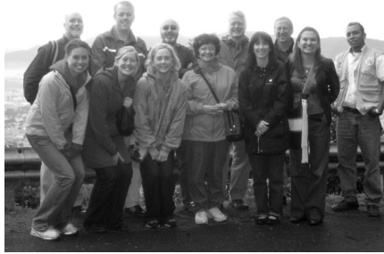
¡El Grupo Fabuloso!

nized Amerindian languages. Guatemala is the most populous of the Central American countries with a GDP roughly one-half of Argentina, Brazil, and Chile. Income and wealth is very unequally distributed and, according to the CIA World Factbook , more than half of the population lives below the poverty line. We expected a poor, mostly agricultural country with challenging geography and with many places where our highly skilled Spanish profs, much less the rest of us, wouldn't have a clue what the people were saying.