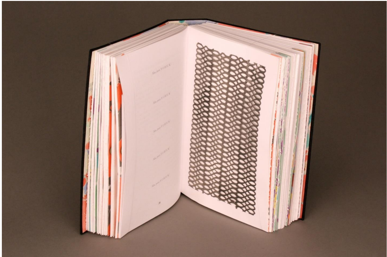
Figure 7. Tristram Shandy , grey page. © Rachel Melis.

fold insert but also after reaching its end (that is, the black-lace leaves): the structure allows the Yorick story to be left standing or folded flat, set aside or reinserted into slits in the book. No matter which choices the reader makes about the accordion-fold digression that is Yorick's story, the chapter in the codex continues through the grey-printed text of Yorick's story and a grey-lace leaf.