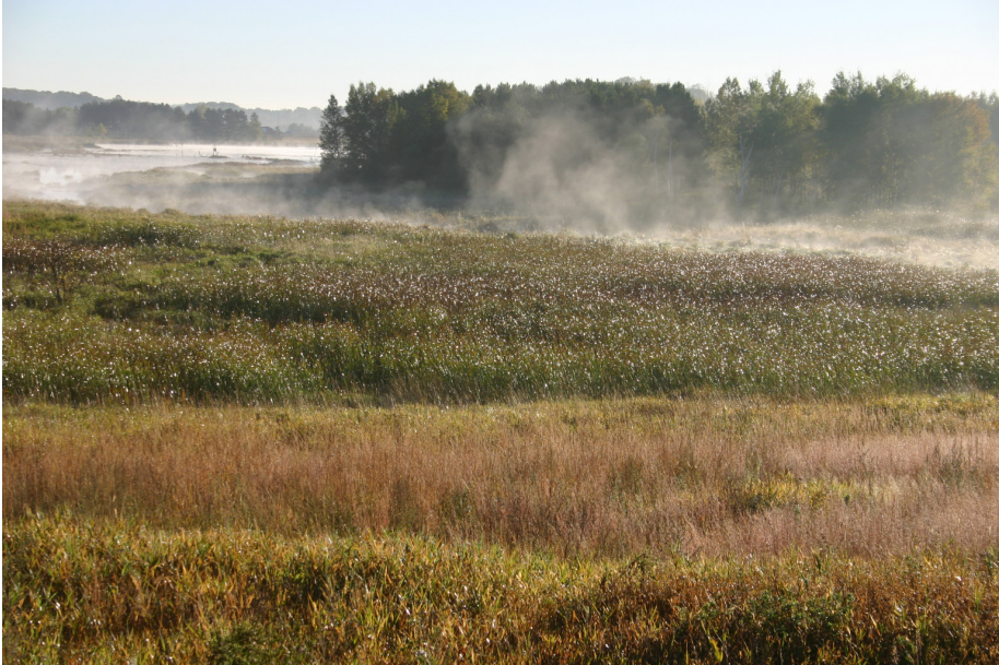
Figure 4. The prairie and wetlands at Saint John's.

although land survey records mention the presence of bur oak. Regardless, the Saint John's Arboretum has restored an 11-acre area to the east of the Gemini Lakes. A botanical survey of this area by CSB student Rebecca Guza in 2001 reported 80 species in this relatively small area.