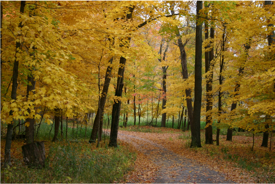
Figure 2. The Saint John's sugarbush in autumn.

Collegetown lies in the Eastern Broadleaf Forest Province of the state that roughly runs from the southeast corner of the state to the northwest corner near Lake Itasca (Clearwater County). This province, which is characterized by deciduous trees, forms a transitional zone between the coniferous forests to the northeast and the prairie to the west and south. Collegetown lies on the southern fringe of the province in an area known as the Hardwood Hills ecological subsection. It is characterized by hummocky moraines that were deposited at the end of the last glacial period. Forests in this region are mesic to dry and dominated by northern red ( Quercus rubra ) and white ( Quercus alba ) oaks. To the south, the area known as the Big Woods forest type (subsection) once extended from northern Wright County southeast to Rice County (Fig. 1). Although only remnants of this great ecosystem remain, some of the forest areas at Saint John's are strikingly similar to the Big Woods. In fact, the deciduous forests of Saint John's form a collage of forest subsets and are an interesting mixture of both.