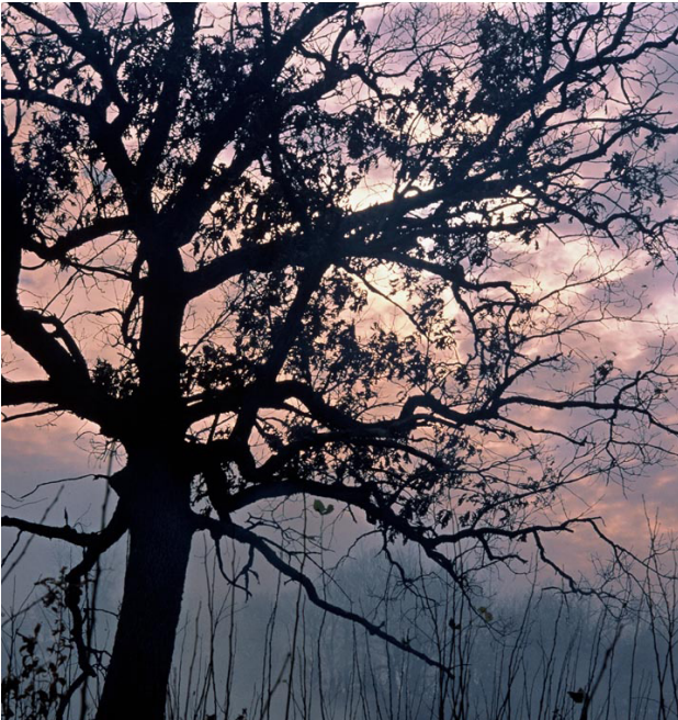
Figure 3. The Saint John's Savanna.

A 56-acre prairie on the north-end of campus, at the intersection of County Road 159 and Interstate 94, welcomes visitors to Saint John's (Fig. 3). To the uninitiated observer, a prairie can be a boring, uniform expanse of grass. Closer inspection will reveal an incredible diversity of both grasses and forbs (non-grassy herbaceous plants). More than 350 species can grow in a single acre of undisturbed natural prairie. More than 250 species have been identified in the Saint John's prairie. Of these, approximately 80 percent are native to Minnesota (McGreevy, 1999). There are at least 25 different grass species growing in the Saint John's prairie, the most common of which are big bluestem ( Andropogon gerardii ), little bluestem ( Schizachyrium scoparium ), and Indian grass ( Sorghastrum nutans ). Common prairie forbs include butterfly weed ( Asclepias tuberosa var. interior ) and prairie clover ( Dalea sp.).