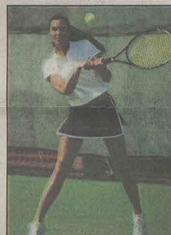
A GSU tennis player aggressively hits the ball back towards her opponent in this file photo.

GSU News Service contributed to this report.