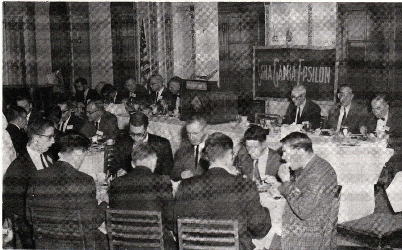
Figure 15. Fiftieth Anniversary of Sigma Gamma Epsilon Banquet held at the Eldridge Hotel in Lawrence, Kansas. Head table is in the background.