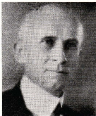
Figure 16. Dr. William Henry Twenhofel.