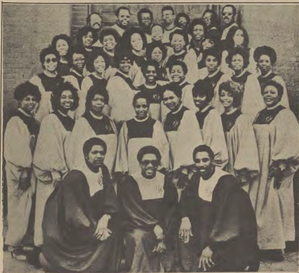
The Institutional Radio Choir of NYC Continuing Education Building. performed February 13 in the