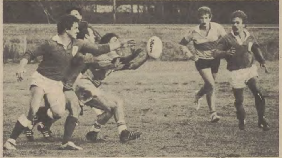
The Southern Ruggers Rugby Club recently played three tough matches. The Eagles beat the Golden Isles and MCG Rugby Clubs, but lost to Georgia.

GSC's next home game will be against Paris Island Rugby Football Club at Oxford Field on Saturday, March 6.