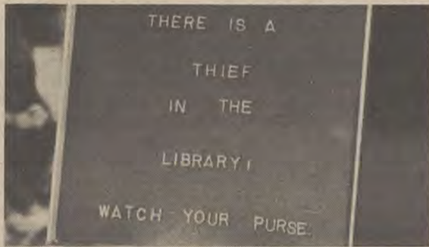
Library sign warns studying students.