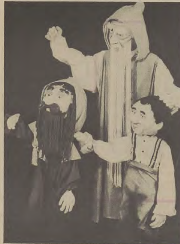
Giant puppets of the Theatre Sans Fil.

Theater reviewers have noted the "stunning color schemes in costumes... the impact of the show is heightened even further when the puppets seem to move by magic in the black-light sequences."