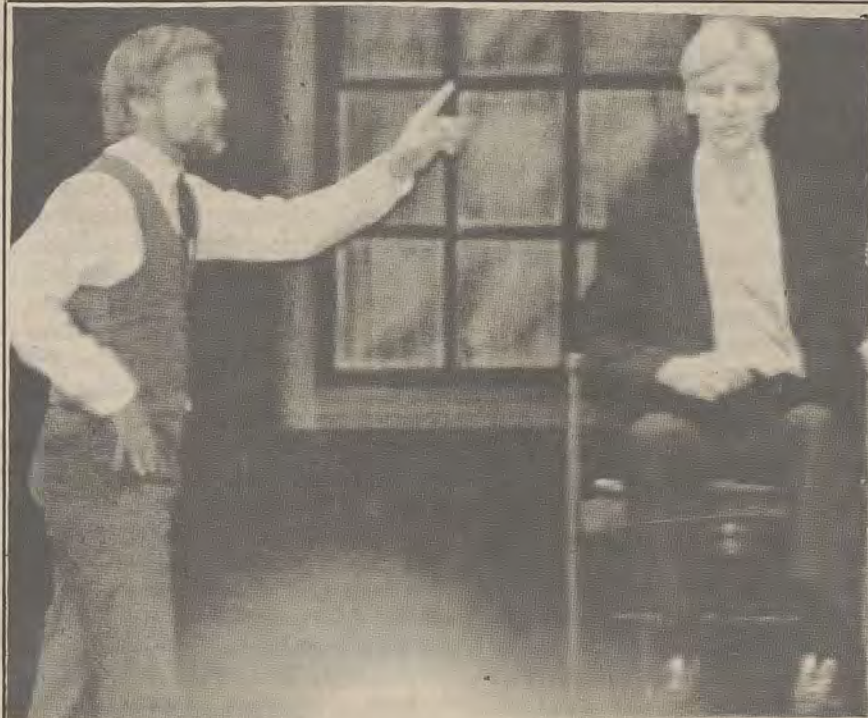
Members of the cast of "The Biko Inquest" are shown here at a McCroan Auditorium performance last week.