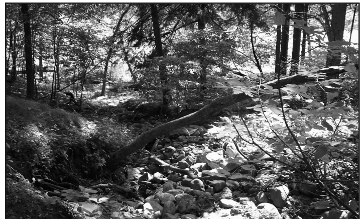
In the Woods