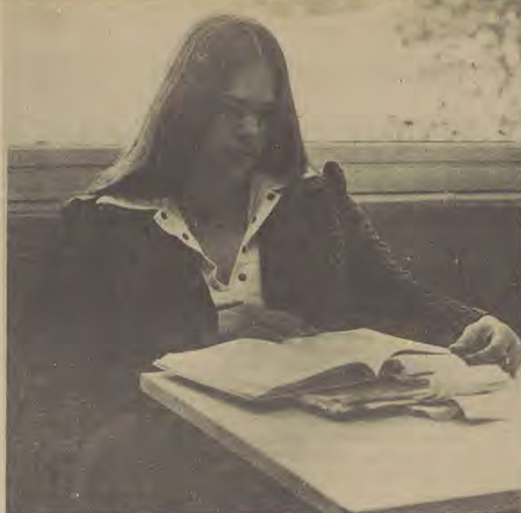
Students and faculty alike are preparing for final exams, the last hurdle of the quarter before Christmas Holidays.