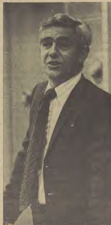
organometallic compounds of the actinide elements, and the magnetic susceptibility of actinide compounds.