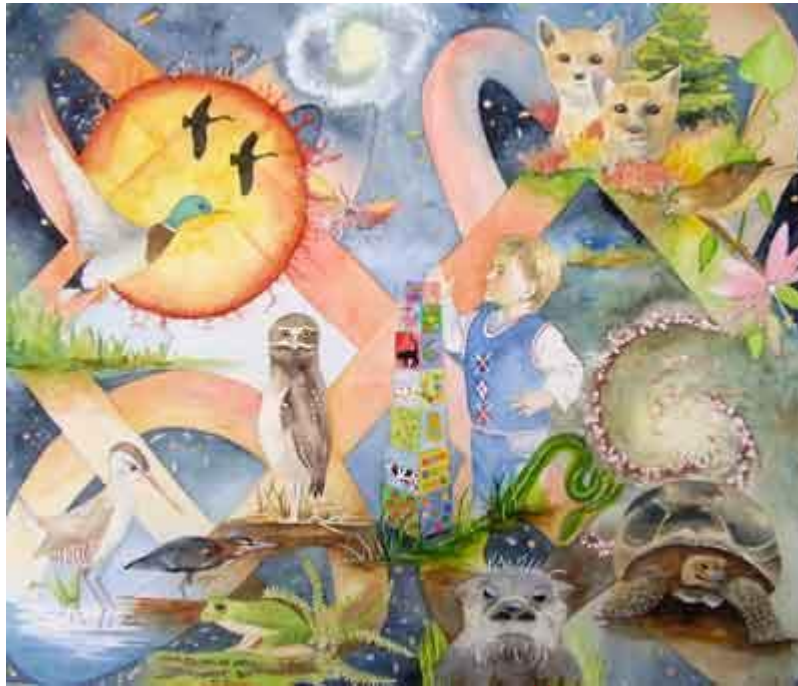
The Faces of Gaia 20