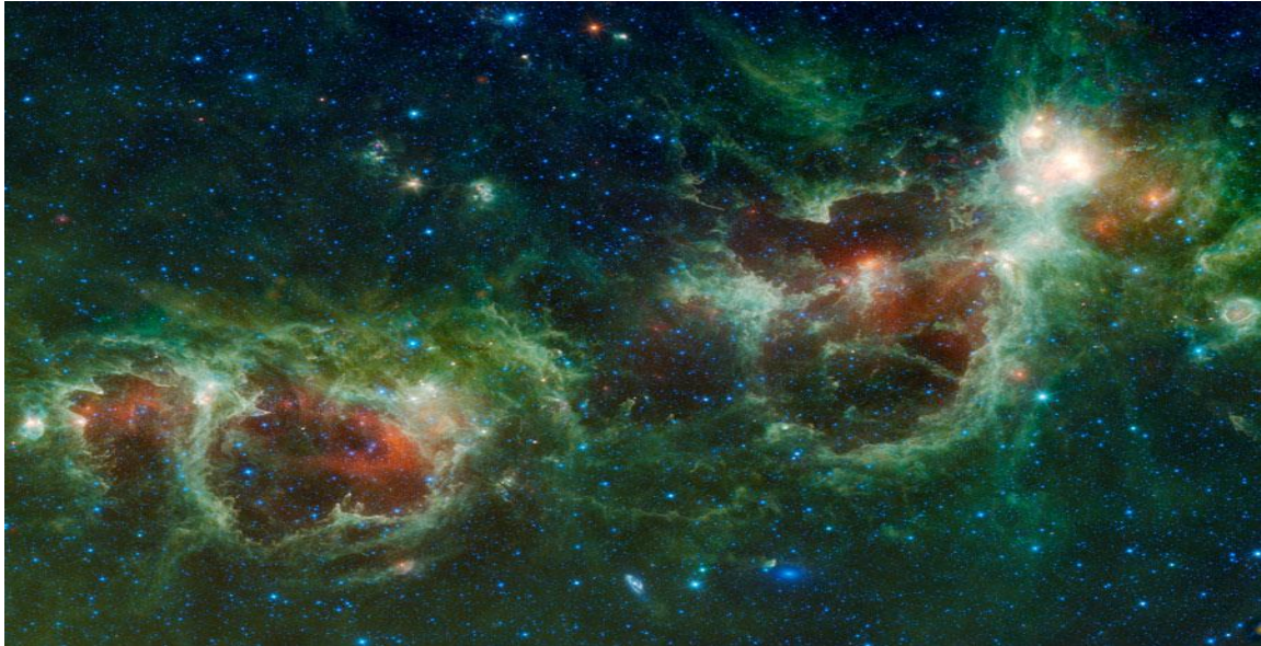
Heart and Soul Nebulae 10

Berry added additional wisdom, insight, and perception. Through the lens of decades of religious studies of the East and the West, Native and indigenous traditions and established religions, 8 Berry saw the tapestry of theological truth in creation and extended this understanding to the necessary interplay of humans as but one constituent element which ought to function in harmony with all of the universe—“The Universe Story.” 9