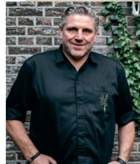
From top: Veal Heart, Brown Crab, Celeriac at De Librije; the restaurant’s chef Jonnie Boer; Brandade of Sturgeon, Green Pea, Cauliflower, Anna Dutch Caviar at Inter Scaldes