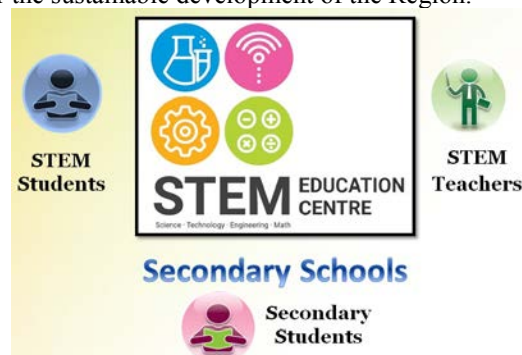
Figure 2 STEM Education Centre

In summary, the STEM Education Centre will serve as a cross-disciplinary platform to support relevant students for better study of STEM related programmes, support staff to deliver curriculum on related trade with innovative pedagogy to enhance the learning and teaching experience. It also serves as a focal point of VPET to interface with secondary schools with the aim to help promoting STEM education in Hong Kong and ultimately nurture young STEM skilled professionals for the sustainable development of the Region.