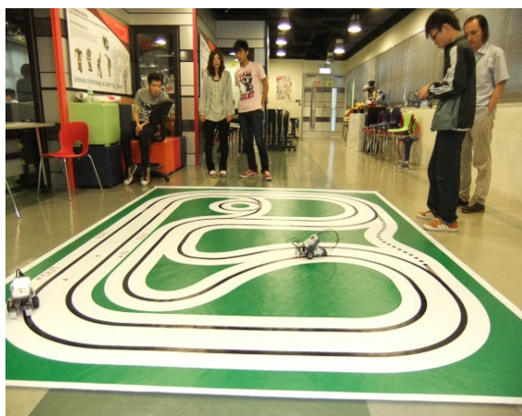
Figure 3 Path Tracking Mobile Robot STEM Project

Project competition is another channel to promote STEM education. Throughout the years, VTC students attended a number of STEM project competitions. For example, VTC students have a long record to participate World Skills Competitions in various trades such as mobile robotics, mechatronics, and software applications etc. The Solar Car and Robocon teams from IVE Engineering Discipline attended the World Solar Challenge in Australia and the Hong Kong Robocon Contest with good achievement. Students are strengthened to solve real life problems with sound engineering principle solution through STEM project competitions. Students also exchange view for code of practice to apply STEM principles to solve real life problems from various countries.