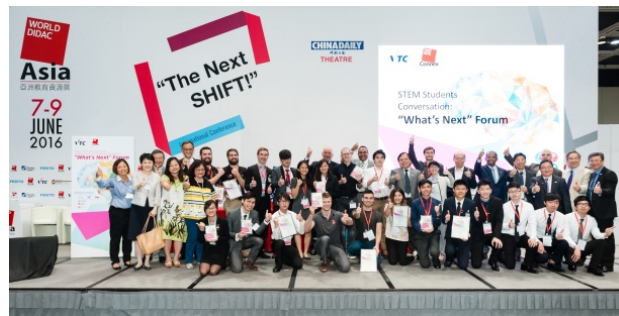
Figure 4 International STEM Students Forum 2016

An International STEM Student Seminar 2017 will be hosted by VTC in June 2017 in Hong Kong. Theme of the seminar is “Voice of Youth: International STEM Students Exchange on Vocational Learning”. The seminar is scheduled for two days and sessions include (i) STEM Students’ forum with Executives, (ii) Invited presentations from STEM teachers/practitioners, (iii) Joint-institute student project presentation, (iv) Student project presentation from different institutions, and (v) Student poster session. Oral presentations and poster session will be reviewed by a technical programme committee. The poster session provides an opportunity for STEM students to present their projects to the Hong Kong and overseas participants in a lively style. Throughout these seminars, it aims to establish an intercultural dialogue among young people from different parts of the world on STEM issues. Also, it can expand the professional networks available to STEM students intending to enter the job market.