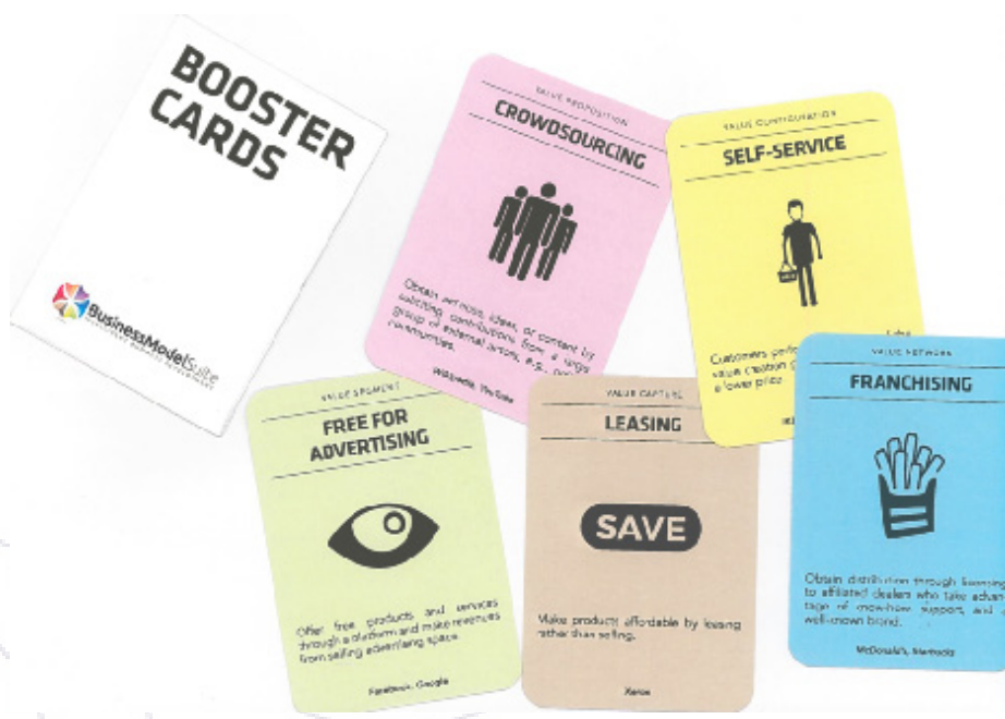
Figure 1: Examples of booster cards.

The cards are based on 71 different BM configurations identified in the work by Taran et al. (2016). Each card in the deck represents a specific configuration and contains a short description of the configuration and real-life example to strengthen the analogy further. The description might give room to gain context-free ideas, but if the students are having issues with generating ideas or understanding the concept, the real-life examples often spur them in the right direction. An example can be found in Figure 1, where the configuration 'Free for advertising' provides both a short explanatory text of the general concept and empirical references (in this case of Facebook and Google).