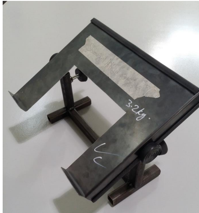
Figure 2: Team 1 the manufactured laptop riser